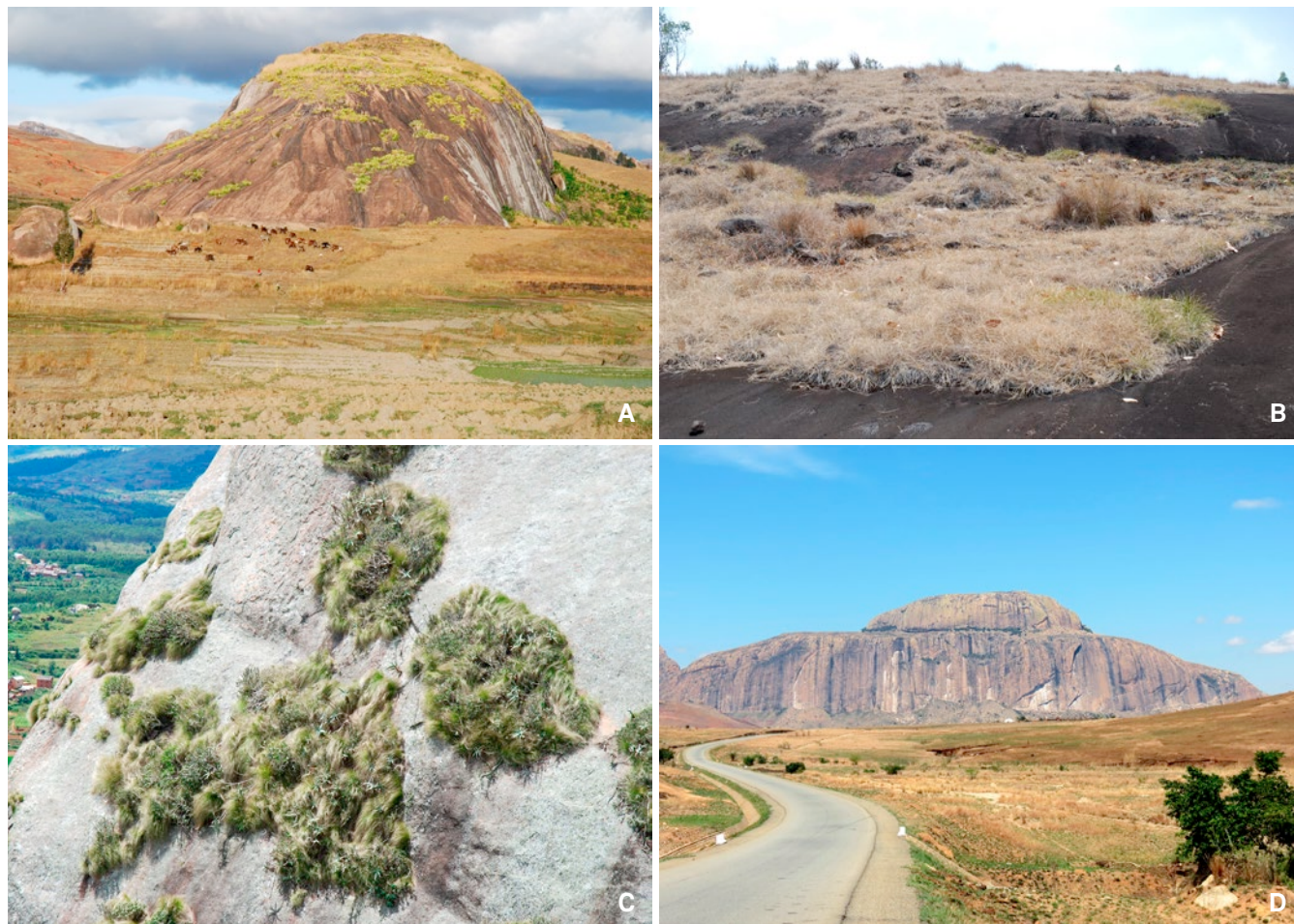
Fig. 6. – A. Inselberg, south of Anja Park (Tangorika) covered with Furcraea foetida (L.) Haw. (Asparagaceae); B. Mat with Stypeiochloa hitchcockii (A. Camus) Cope (Poaceae) near Angavokely; C. Mats formed by Coleochloa setifera (Ridl.) Gilly (Cyperaceae) and steep slopes, south of Fianarantsoa; D. General overview of “Bonnet du Pape, at Voatavo (Fig. 3: n° 26).

exceptions include those within certain National Parks such as Andringitra and Marojejy. In unprotected areas globally, inselbergs often support the last remnants of natural vegetation in a given area. While certain types of human use of inselbergs have occurred for generations and do not seem to have caused severe damage, in recent times human impact appears to have become by far more destructive resulting in steadily growing pressure on these areas, and today most inselbergs in Madagascar exhibit detrimental human impacts. These include: the over-collection of certain useful species which impacts local populations or even threatens local endemics with extinction; use of inselbergs for grazing cattle and goats; uncontrolled bush-fires, usually resulting from the widespread burning of grasslands for agriculture, that may significantly impact the population of individual species and which are also responsible for habitat degradation or destruction as a whole (see WHITMAN et al., 2011 for a study of the influence of fire and water availability