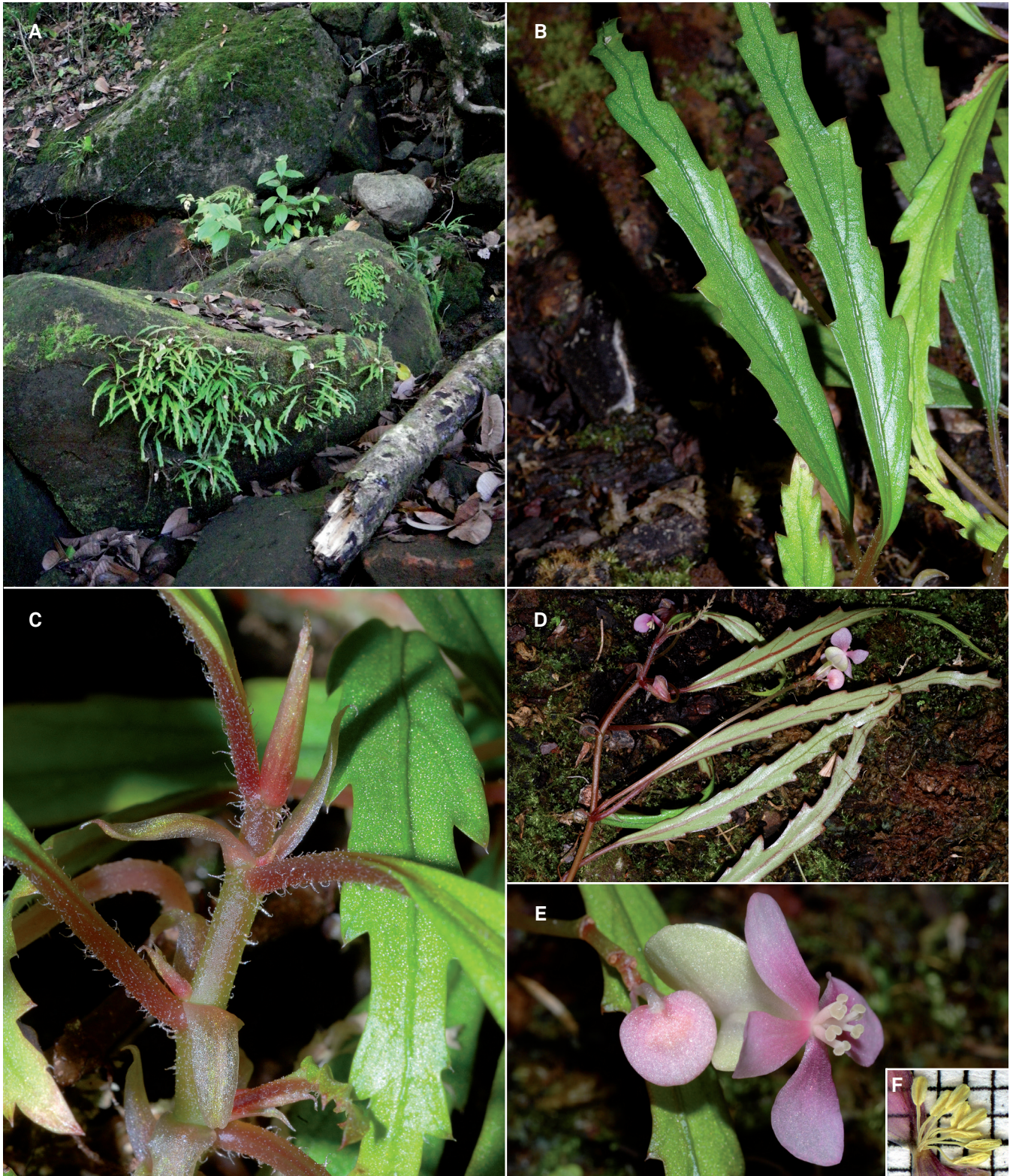
Fig. 2. – Begonia henrilaportei Scherber. & J. Duruisseau. A. Habit in the type locality; B. Leaf adaxial surface; C. Apex of stem; D. Leaf abaxial surface; E. Inflorescence showing female flower and male flower bud; F. Stamens.