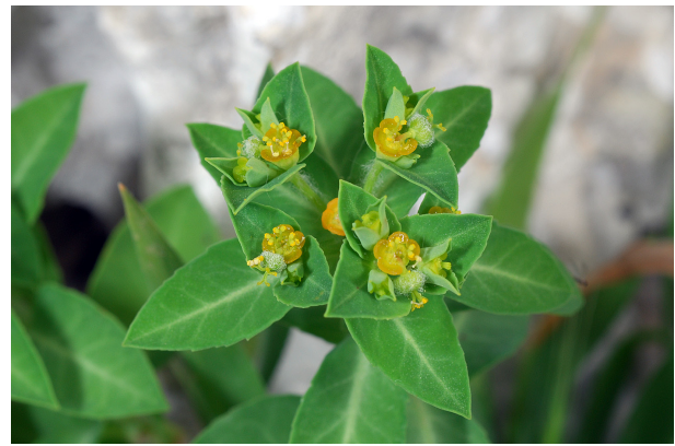
Fig. 3. Euphorbia berythea , flowering stem. – Cyprus, Sotira, near Agios Antonios (Ammochostou), 9 Mar 2008, photograph by C. S. Christodoulou.

Second published record for Cyprus (see Hadjikyriakou 2009 for the other record and Meikle 1977 on earlier unsubstantiated records). To be classified as naturalized non-