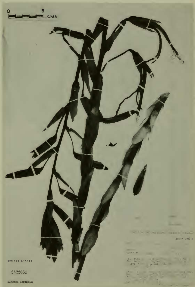
Puya mimia Smith & Read