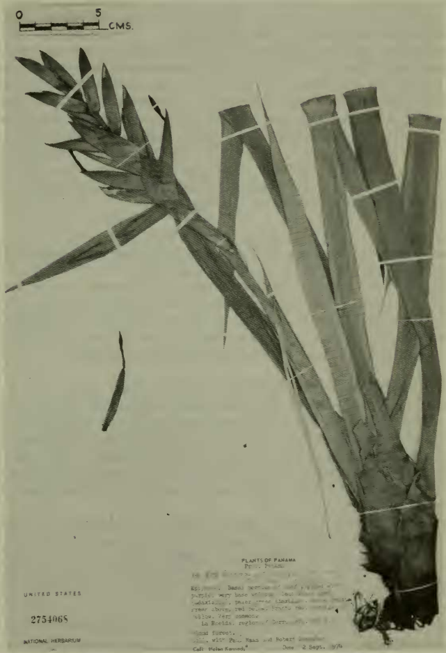
Guzmania kennedyae Smith & Read