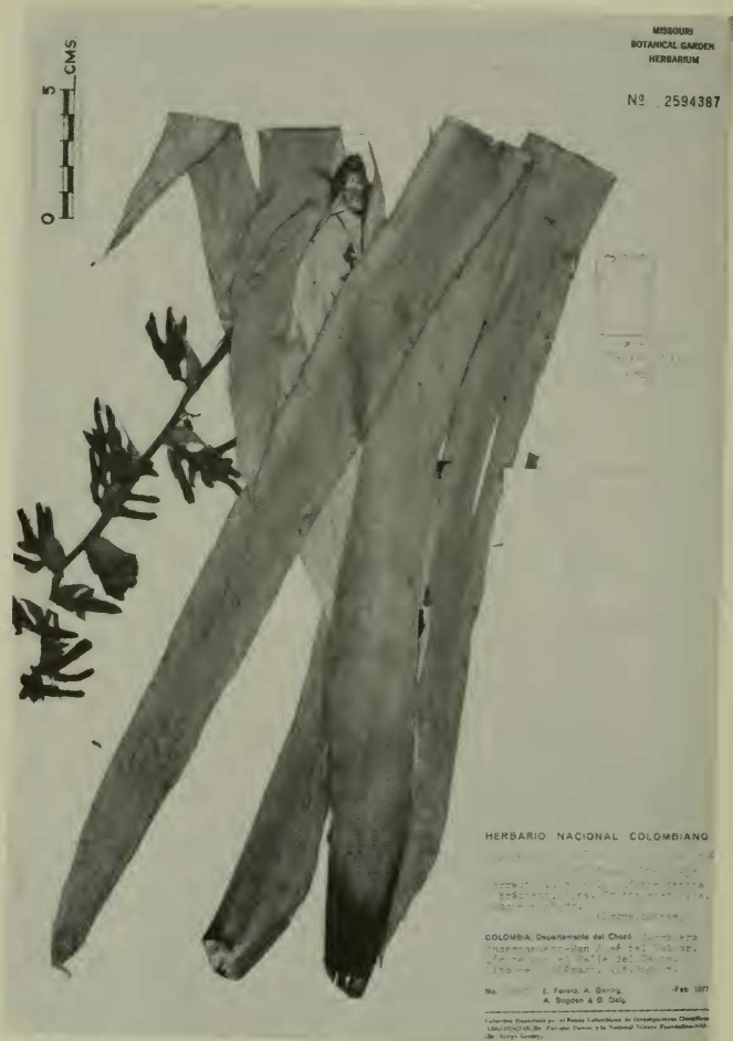
Guzmania testudinis Smith & Read