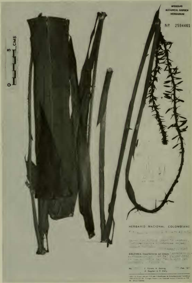
Pitcairnia bicolor Smith & Read