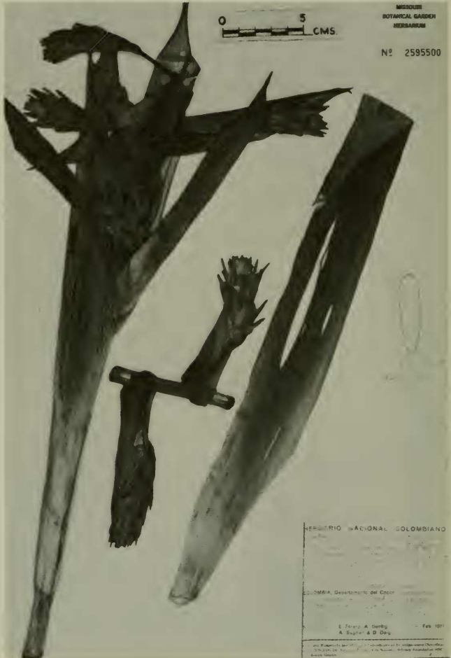
Guzmania rugosa Smith & Read