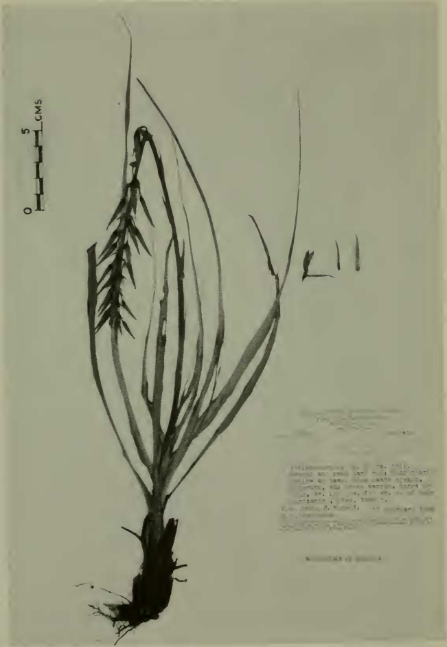
Pitcairnia curvidens Smith & Read