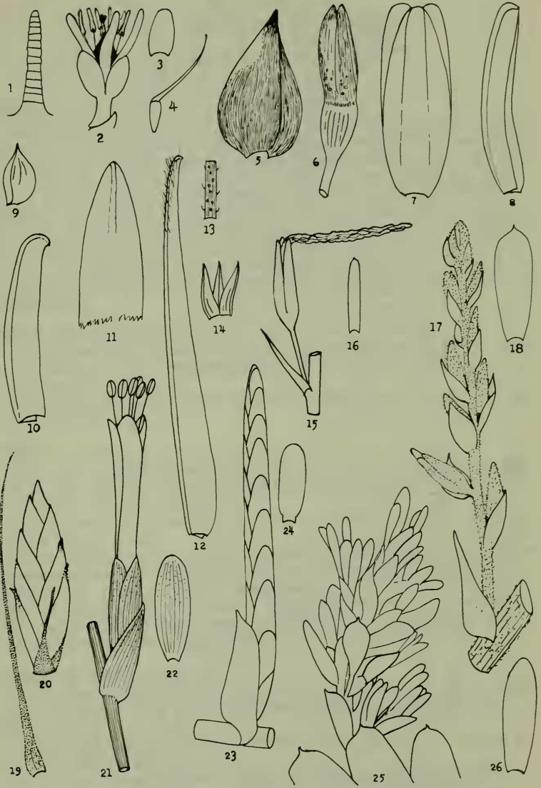
See opposite page for explanation.