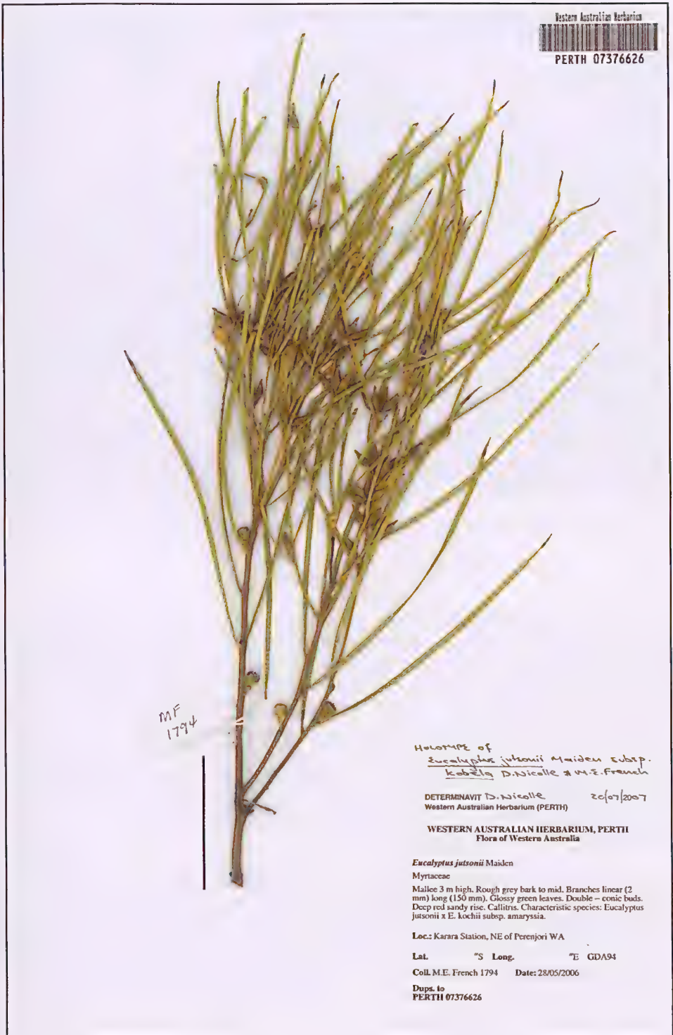
Figure 2. Holotype of Eucalyptus jutsonii subsp. kobela (M. French 1794) [Lat. and Long. masked]. Scale = 5 cm.