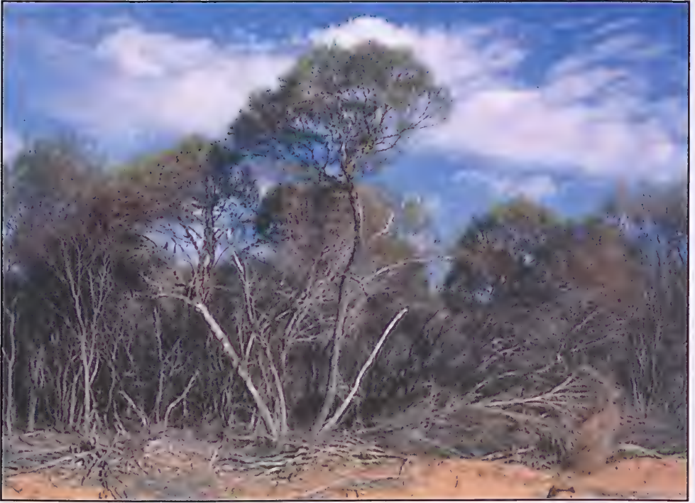
Figure 3. Habit and habitat of Eucalyptus jutsonii subsp. kobela (Lochada Station, NE of Perenjori, D. Nicolle 4448 & M. French).

Distribution and habitat. Eucalyptus jutsonii subsp. kobela is known only from Lochada and Karara Stations, about 70 km east of Morawa in Western Australia (Figure 1). It is known from two subpopulations approximately five kilometres apart, with an estimated 50 individuals scattered over approximately one kilometre at the northern subpopulation (within Lochada Station) and only a handful of scattered individuals known at the southern subpopulation (within Karara Station).