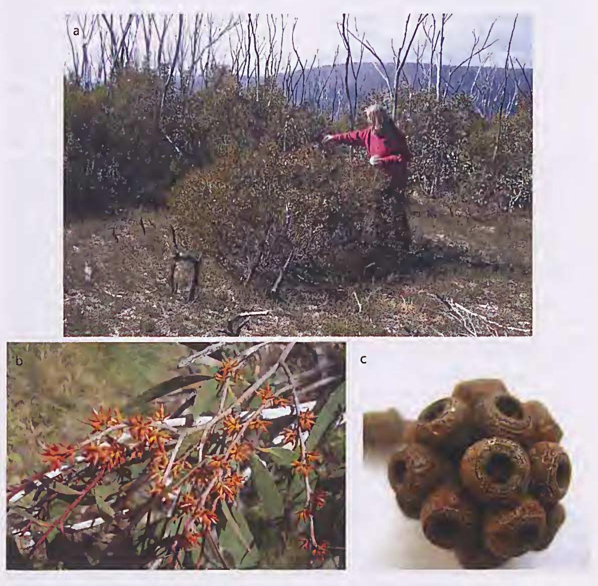
Figure 3. Eucalyptus forresterae a) regenerating mallee at Brumby Point post 2003 fires (Molyneux, 15/11/08); b) buds and adult leaves at Brumby Point (Molyneux, 15/11/08); c) fruits from type locality (Rule, 6/2/10)

Associated species: Eucalyptus sp. aff. dives Schauer, E. elaeophloia Chappill, Crisp & Prober, E. glaucescens Maiden & Blakely, E. kybeanensis Maiden & Cambage, E. mannifera Mudie, E. pauciflora Sieber ex Sprengel subsp. niphophila (Maiden & Blakely) L.A.S.Johnson & Blaxell, E. perriniana F.Muell. ex Rodway, E. rubida H.Deane & Maiden, E. viminalis Labill. subsp. viminalis and Hakea asperma Molyneux & Forrester have been