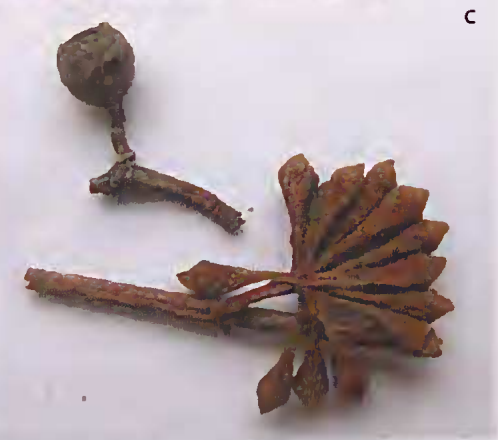
Figure 2 . Eucalyptus ornans a) mallees prior to 2007 flooding of the Avon River (Rule, 13/9/06); b) canopy of immature mallee (Rule, 13/9/06); c) buds and fruits ( Rule 3805 )