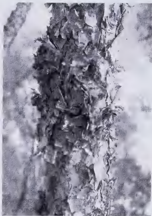
Figure 6. Bark on lower trunk of Eucalyptus chartaboma .