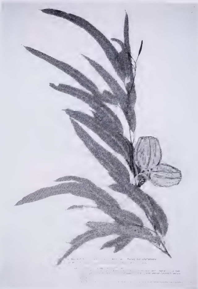
Figure 4. Holotype of Eucalyptus chartaboma (D. Nicolle 2509).