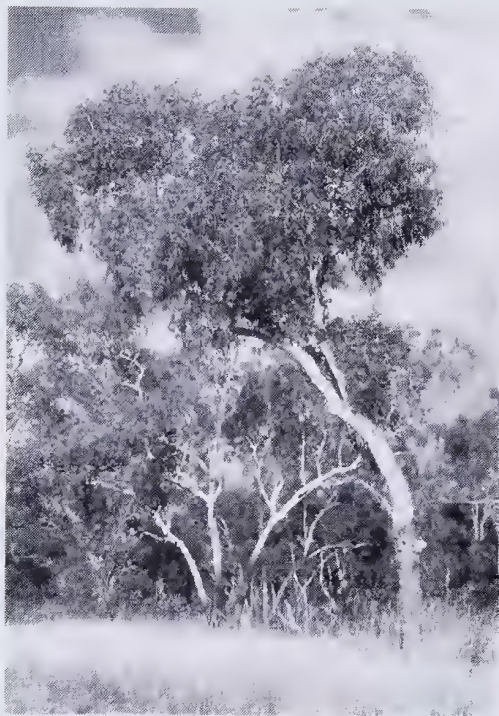
Figure 5. Eucalyptus chartaboma habit from between Pentland and Burra, Queensland.