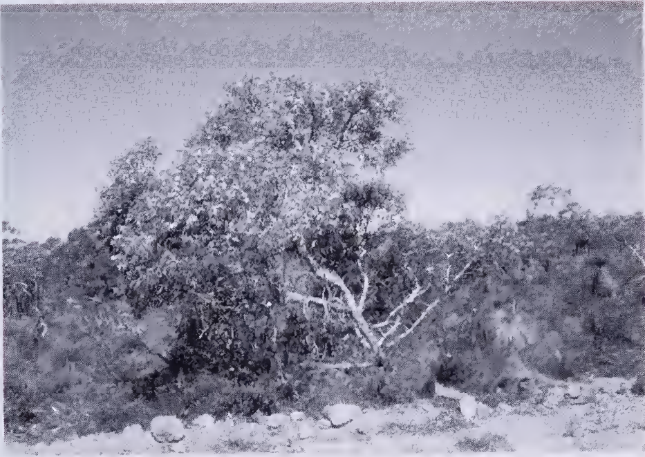
Figure 2. Eucalyptus gittinsii subsp. illucida habit north-west of Dandaragan.

Conservation status. Of scattered occurrence but locally abundant and not considered to be threatened. Known from several conserved areas including Lesueur National Park and Coomaloo Nature Reserve.