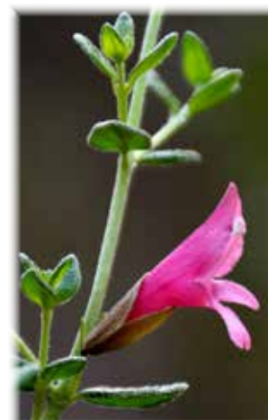
Prostanthera calycina (Ben Eaton)

Sunday 25 October, 2020 Coach Tour – Garden Visits