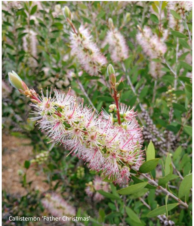
Callistemon 'Father Christmas'