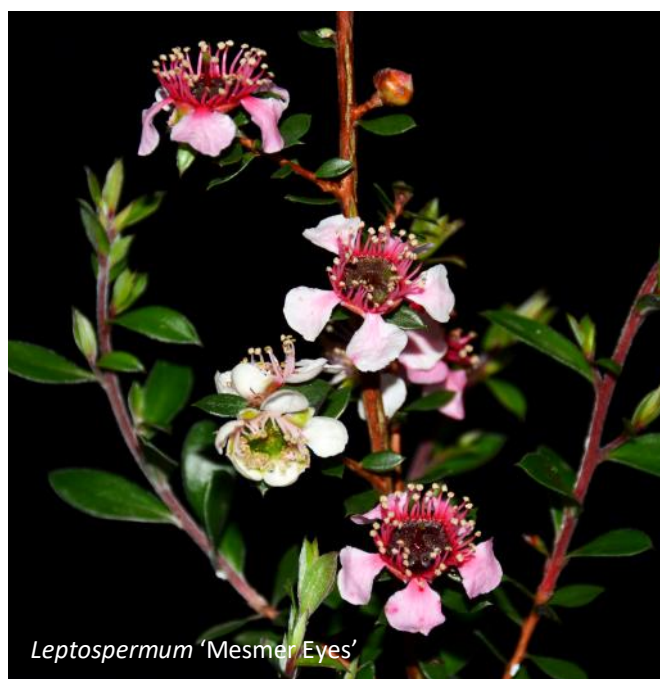
Leptospermum 'Mesmer Eyes'