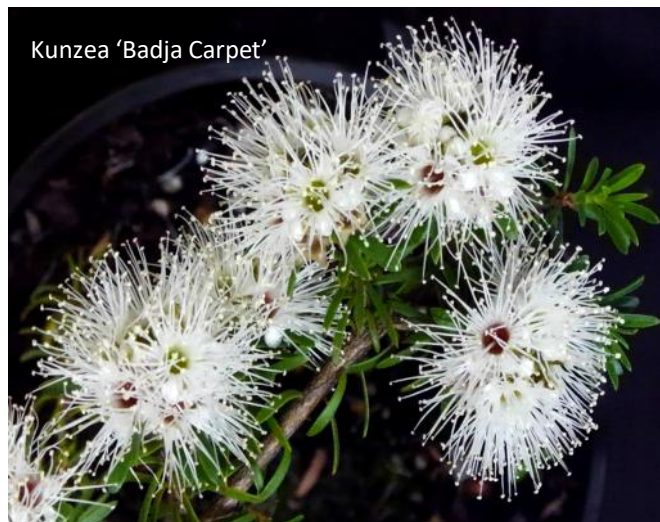
Kunzea 'Badja Carpet'

Leptospermum 'Mesmer Eyes' (PBR, 1.5m x 1m, hybrid developed by Bywong Nursery NSW – L. scoparium nanum rubrum , L. macrocarpum and L. deuense , probably using the more colourful NZ form of L. scoparium as one of the parents)