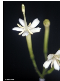
Flowers.