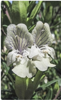
Flowers and leaves. Mt Buffalo, Vic