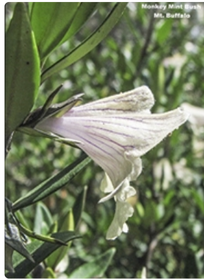
Flower and leaves. Mt Buffalo, Vic