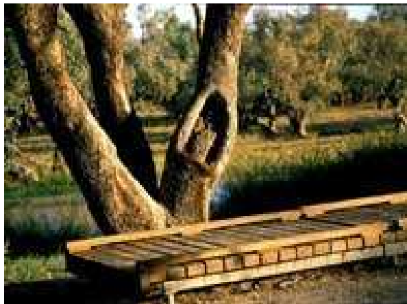
Burke and Wills Dig Tree, Thargomindah.

Burke and Wills were the first explorers to traverse the continent from south to north, opening up the country to pastoralism, though the expedition itself proved disastrous. In December 1860 Burke and seven men established Camp LXV (65) at Cooper's Creek where Burke split his party before pressing on to the Gulf accompanied only by Wills, King and Gray.