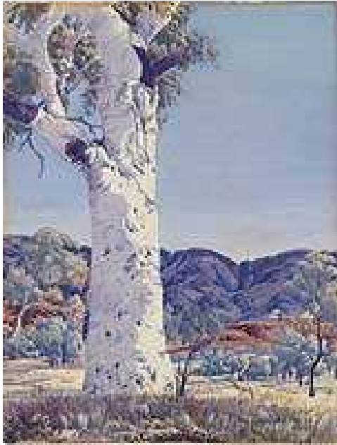
Albert Namatjira (1902-1959), Ghost gum, c.1948, watercolour.

The grandeur and spirit of eucalypts was captured on canvas in an iconic fashion by Albert Namatjira. Namatjira's renditions of gums in his country became iconic symbols of the Australian spirit.