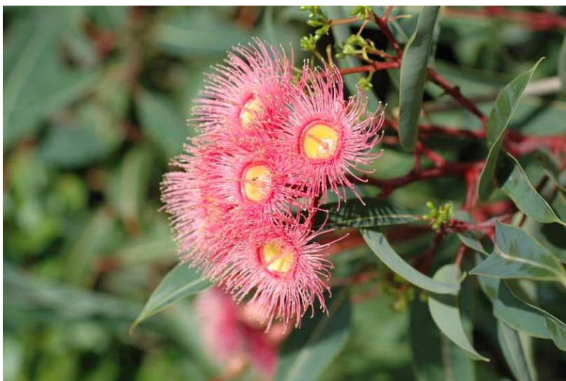
‘Summer Beauty’ – soft pink flowers, to 5m tall.

Corymbia is a fairly recent genus (previously in Eucalyptus ) of about 110 species of evergreen trees, generally known as “bloodwoods”, with outstanding terminal flowers. Their nectar-rich flowers are white, yellow, cream, red, pink or orange with stamens held in cup-like bases. Urn-shaped capsules form after flowers fade, against aromatic gum leaves. They enjoy full sun and are tolerant of drought and light frost once established, can tolerate pruning if you so desire and need little else. Most are fast-growing and long-lived, however growing species outside of their endemic region can be problematic, with Western Australian species struggling in the wet, humid summers of the Eastern states. Corymbia ficifolia ( Eucalyptus ficifolia ) – one of Western Australia’s best, with red, orange, white or pink flowers and a rounded canopy to 9m tall, thrives in low humidity, however the following Summer Series hybrids have been developed for gardens across to Sydney and up to Brisbane. Grafting has made them tolerant of most soil types and also insures that vigour, colour and size grow ‘true to type’.