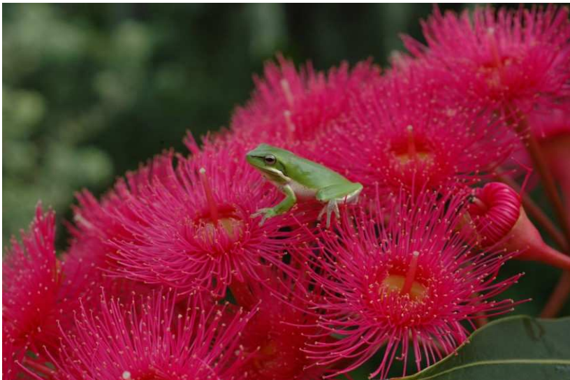
'Summer Glory' – vibrant pink flowers, 4-6m tall.

Spring : Fertilise in early spring with a native fertiliser. The recommended time to plant a young tree is in early spring, after the threat of frost has passed. A free draining spot is best; improve the soil with composted cow manure and slightly mound-up the planting location. This will improve drainage and root development. Avoid disturbing the root ball unless roots are 'pot bound', in this case, lightly tease out the lower roots. Plant centrally in the mound at a depth not above the graft union; identified by a change in bark colour. Firm down the soil lightly and water in well with a seaweed solution.