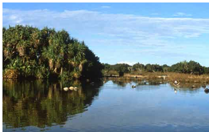
P. tectorius growing next to a freshwater pool at Aldabra.

To re-establish the productivity and some, but not necessarily all, of the plant and animal species thought to be originally present at the site. For ecological or economic reasons the new habitat might also include species not originally present at the site. The protective function and many of the ecological services of the original habitat may be re-established.