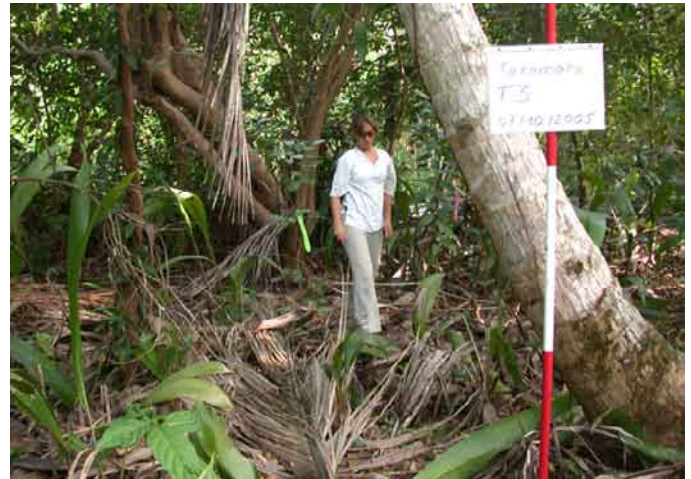
Field Work on North Island.

Rehabilitation is defined as the return of an ecosystem to a close approximation of its condition prior to disturbance. This process is time consuming and will last many years. The work we did on North island is the first step in this long-term process. It forms part of the Rehabilitation of Island Ecosystems project led by the Island Conservation Society and funded by FFEM (French GEF), the objective of which is to rehabilitate a number of islands in Seychelles inclu-