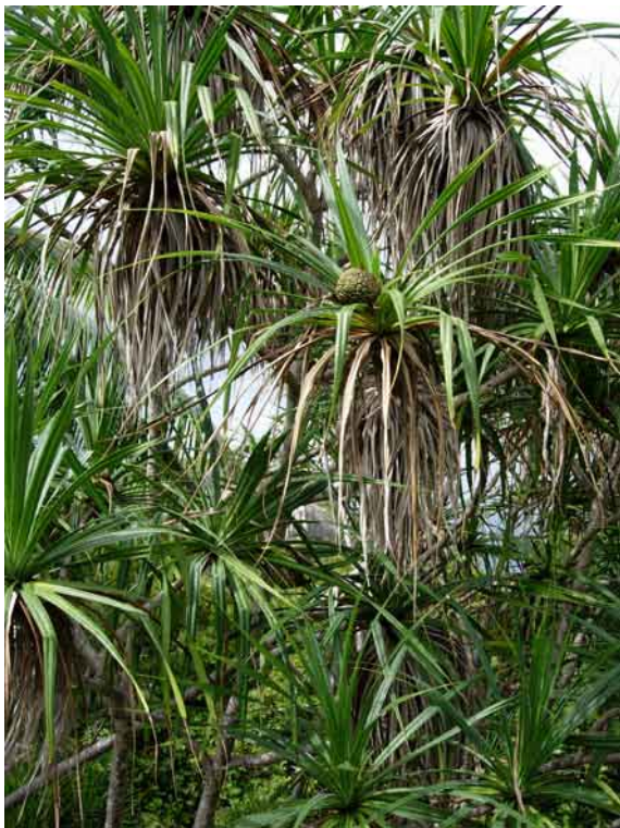
Pandanus balfourii (C Ramseier & S Mannes).

Everybody who visits North Island for the first time is taken aback by the huge number of coconut palms growing on the island. This is due to North Island's history as a coconut plantation in the 19th and 20th centuries. After some years of relative neglect, in 1997 the island was purchased by a group of shareholders who built North Island Lodge, a tourist establishment. They realized that the island's flora and fauna was in a bad condition – generally speaking, over 90% of the landscape was sculptured by man. Fortunately the North Island Lodge management is committed to rehabilitating the island, working together with local experts.