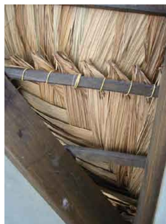
Modern thatching the traditional way - using Latanniyen fey leaves and Coco-de-mer 'zig' string. The photo shows the inside of the roof (K Beaver).

Being able to transport and store water was essential. Not surprisingly, the huge nuts of Coco-de-mer palms were utilised for water storage, as were the large leaf bases of Palmis, which when fresh are pliable and can be pinned up to form containers ('basen'). However, a more common use for these leaf