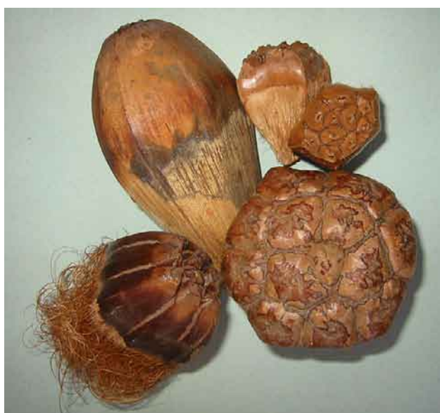
Phalanges (fruit sections) from 2 trees of P. tectorius (right) showing typical variation in size and structure, alongside those of P. hornei (top left) and P. sechellarum (bottom left) (K Beaver).

Aldabra atoll has a completely different geological history from the granitic islands. It has a more recent origin and is formed entirely of limestone. The plants are mostly of African/Malagasy origin. Vast areas are covered with Pemphis scrub and mixed scrub, and the lagoon is fringed with mangroves. There are a significant number of endemic species and sub-species, which is unusual for an atoll and partly a result of the large and varied terrain of Aldabra.