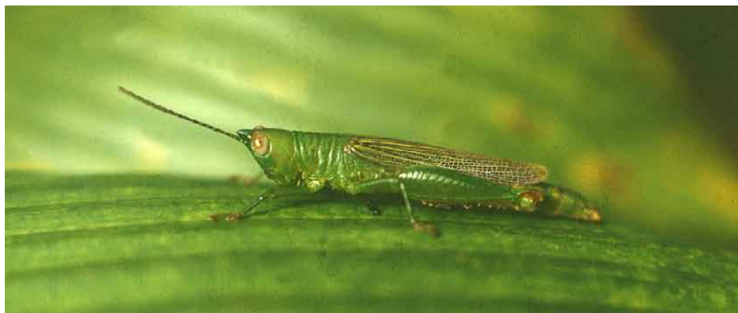
Gardiner's grasshopper ( Enoplotettix gardineri ) (K Beaver).

There is much scope for further research on the insect fauna of palms and pandans in Seychelles. Which insects are obligate associates (cannot survive elsewhere) and which are only frequent (opportunistic or facultative) associates? Which species are associated with which species of palm or pandan? The answers to these questions, like the life histories of most of these insects, have yet to be worked out. Of course, it is vital that we keep on protecting our remaining palm and pandan forests, because their destruction would mean the disappearance of these unique animal communities.