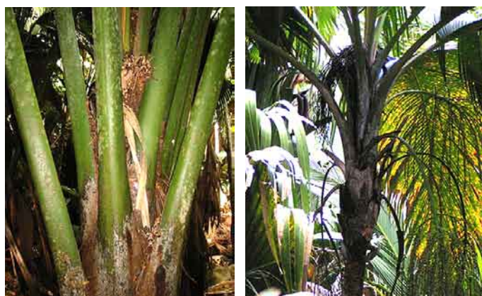
Micro-habitats in juvenile Coco-de-mer and Latannien fey.