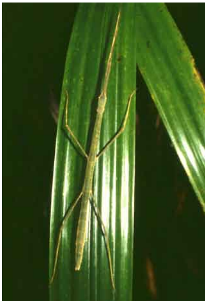
The stick insect Graeffea seychellensis.