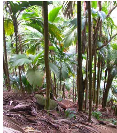
Palm forest at La Reserve (E Schumacher).

And, it must be pointed out that all is not well in La Reserve. There are various threats which pose a danger to the whole ecosystem. Well known invasive species have established and thrive within the reserve. Species such as Bracken fern and Prin-de-frans are localised; but others such as Wild guava, Alstonia and the creeper Merremia peltata are more widespread and pose a real threat. Merremia seems to have established a real foothold in the reserve and its rate of invasion should be of real concern to the authorities. In addition, several Bwa dou trees have been felled by unscrupulous collectors of medicinal plant material. Other highly threatened species may be subjected to the same fate as no effort is being made to apply sustainable collection practices.