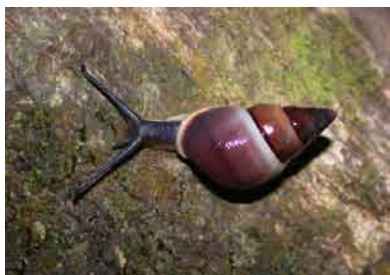
Endemic Pachnodus snail found in La Reserve (E Schumacher).

Because of the high diversity of plant species, La Reserve supports a number of endemic and indigenous animals, including birds, bats, reptiles and insects. Among the endemic bird species are the Seychelles Blue pigeon, Sunbird, Kestrel and Bulbul. Perhaps the most interesting creatures found in La Reserve are the endemic chameleon, stick insects and land snails.