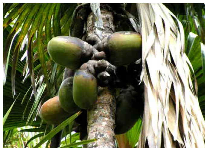
Coco-de-mer fruits (L Chong-Seng).

The amazing nature of both the tree and its seeds has captured the interest of a wide range of people, from rulers such as the Hapsburg Emperor Rudolph II to General Gordon of Khartoum; and from the olden-time pilgrims to Mecca, to the first Seychelles settlers, whose traditional uses of the palm were many and varied (see p 13). Nowadays, the seeds are still greatly valued and therefore harvested. Alt-