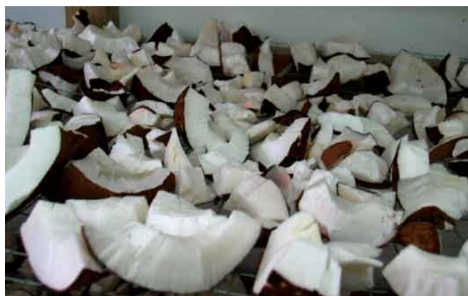
Coco-de-mer kernel being dried before export to the Far East.

Nevertheless, because of the relative lack of information on the life cycle of Lodoicea it is imperative that the Precautionary Principle be used, particularly until such time as monitoring data can be fed into the management and decision-making process. Adaptive management is identified as crucial, to ensure sustainable exploitation; that is, management has to integrate research results directly into the conservation strategy for Lodoicea . In the mean time a conservative approach has to be taken towards, for example, the number of nuts left in the forests for regeneration. In addition, the application of legislation as a tool in the conservation of Lodoicea has been reviewed and the current Coco-de-mer Management Decree will require updating to be effective.