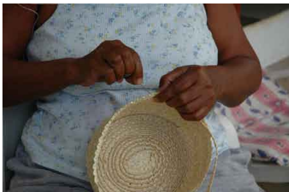
Praslin lady creating a hat with a long plait made of soft immature leaf of Coco-de-mer (L Chong-Seng).

When settlers arrived in Seychelles in the late 18th Century, they found many uses for the native plants, including the endemic palms and pandans. Shelter was a primary consideration and Latanniyen fey leaves were used for thatching house roofs. On Praslin the much larger Coco-de-mer leaves were utilised, with their huge leaf stalks creating attractive ornamental roof ridges and corners. However, W H Est-ridge in 1885 reported that “although much cooler, thatched houses are not so pleasant for hot climates on account of the centipedes and other pests they harbour”! Palm leaves could also be used for house walls and inner partitions, but more substantial walls were created from lathes ('lat'). The trunk of a Latanniyen lat was split into four and the softer inner part removed, leaving one inch thick lathes which could be arranged in attractive patterns. The long aerial roots of Vakwa maron were also utilised in this way but because of their smaller size were split into just two pieces (known as 'lati').