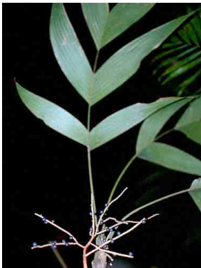
26 Rooster tail Geonoma deversa