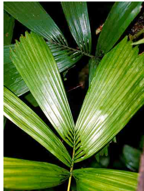
34 Reinhardtia gracilis