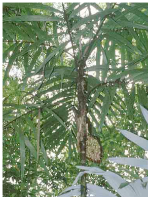
12 Bactris 3