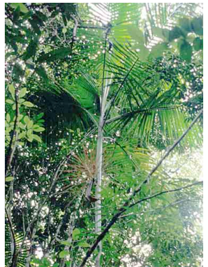
30 Palm Prestoea decurrens