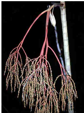
28 Palm Geonoma