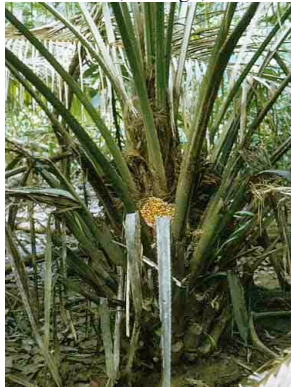
23 African hone Elaeis oleifera