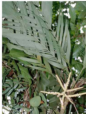
29 Sumu leaf Geonoma