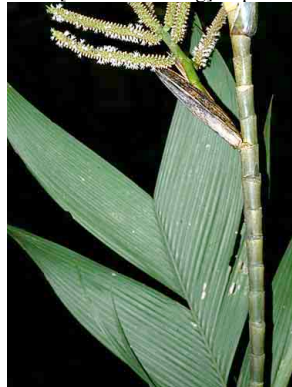
24 Kish kish Geonoma congesta