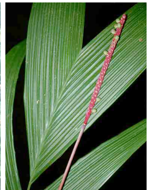
15 Calyptrogyne ghiesbreghtiana