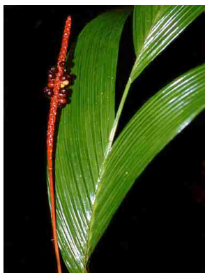
16 Calyptrogyne ghiesbreghtiana