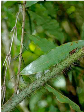
21 Baskit Desmoncus orthacanthos