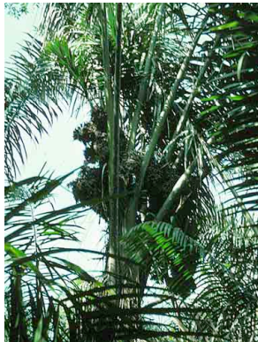
32 Silico Raphia taedigera