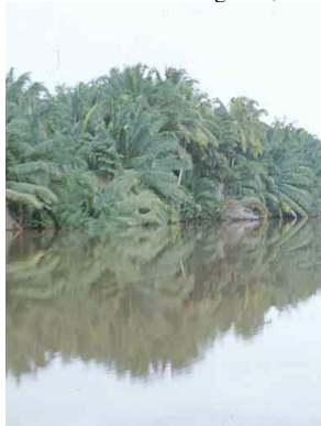
22 African hone Elaeis oleifera