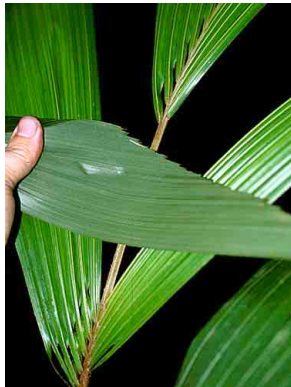
33 Reinhardtia gracilis