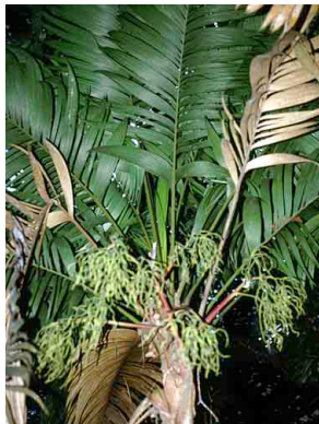
27 Sumu leaf Geonoma