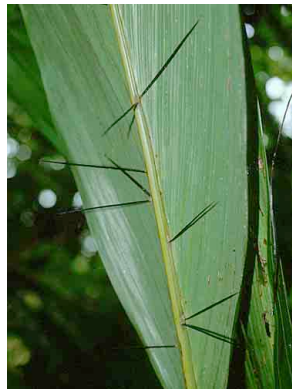
8 Bactris militaris