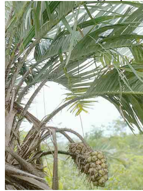
4 Kaka Astrocaryum alatum