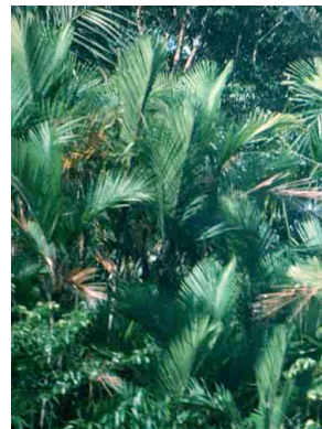
14 Cucumba Bactris 4