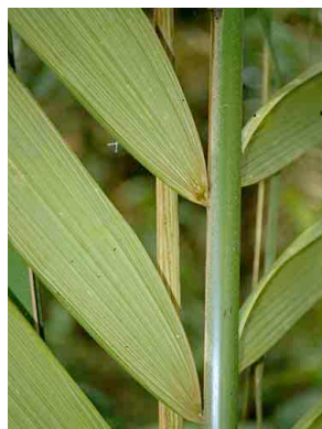
39 American palm Welfia regia