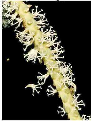
3 Sweeta Asterogyne martiana