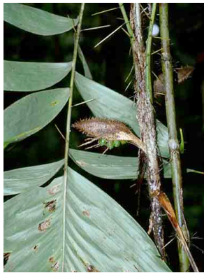
7 Bactris hondurensis