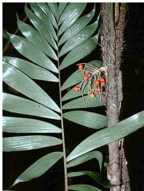
11 Supa Bactris 2