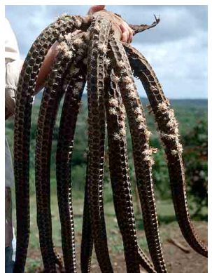
40 American palm Welfia regia