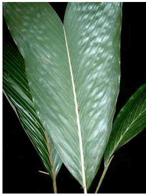
6 Bactris hondurensis