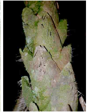
5 Kaka Astrocaryum alatum