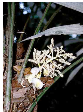
19 Broom leaf Cryosophila warscewiczii