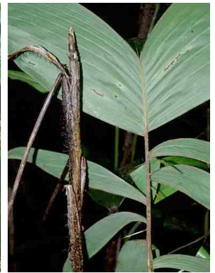
10 Bactris 1