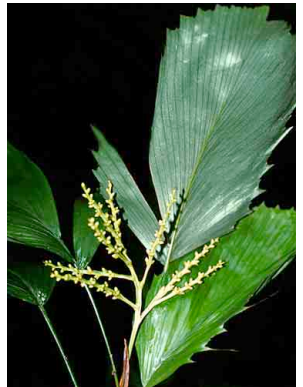
35 Reinhardtia simplex