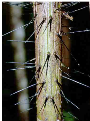
13 Bactris 3