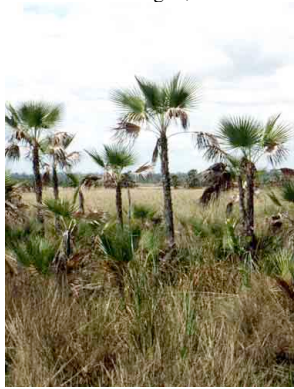
1 Papa Acoelorrhaphe wrightii