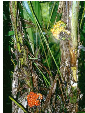
9 Bactris militaris