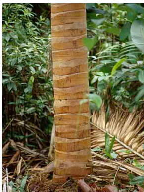
38 American palm Welfia regia