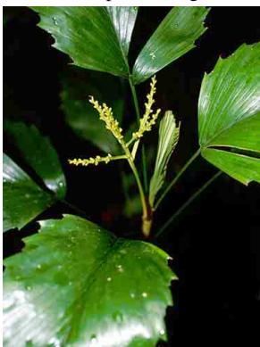
36 Reinhardtia simplex