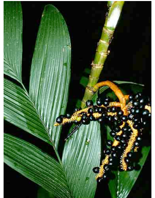
25 Kish kish Geonoma congesta