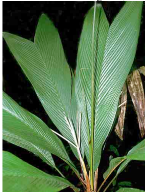
2 Sweeta Asterogyne martiana