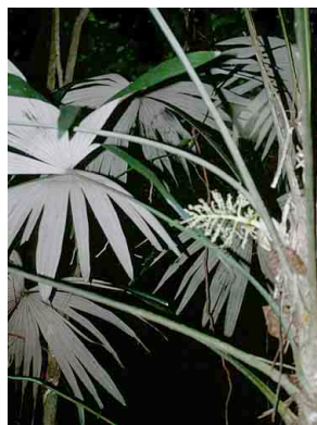
18 Broom leaf Cryosophila warscewiczii