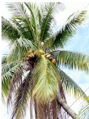
17 Coconut Cocos nucifera