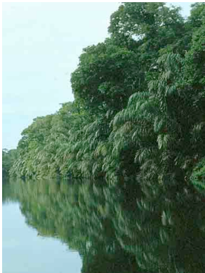
31 Silico Raphia taedigera