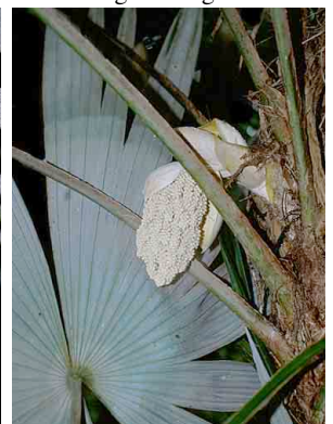
20 Broom leaf Cryosophila warscewiczii