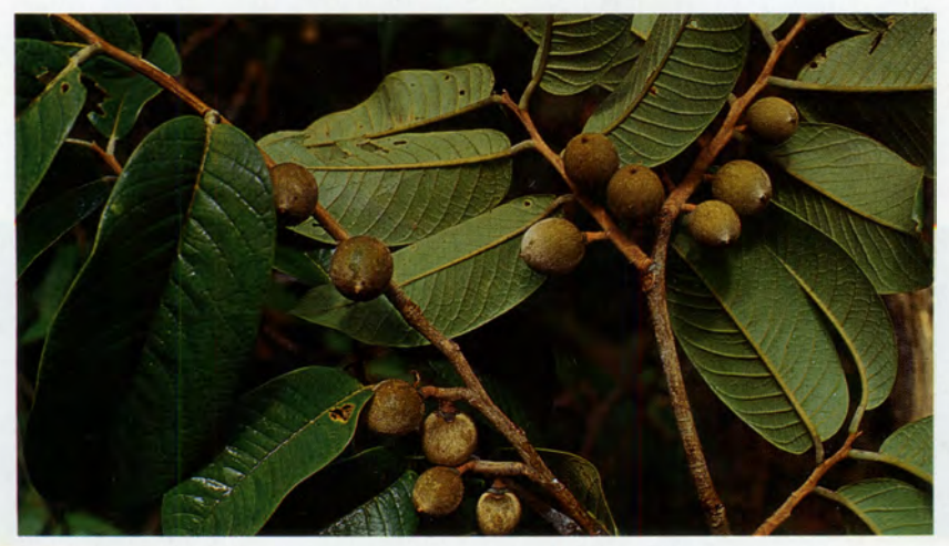
Figure 2. A fruiting specimen of Diospyros pemadasai Jayasuriya.

Figure 1. Diospyros pemadasai Jayasuriya. Habit, fruiting branch with leaves showing upper surfaces except distal leaf. which shows lower surface (drawn from Jayasuriya 9057).