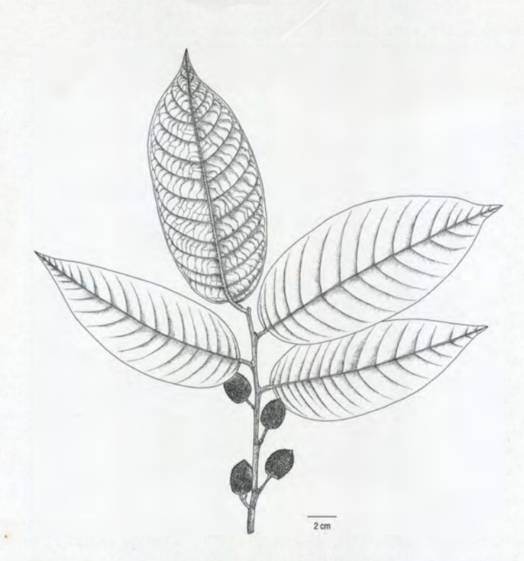
Figure 1. Diospyros pemadasai Jayasuriya. Habit, fruiting branch with leaves showing upper surfaces except distal leaf. which shows lower surface (drawn from Jayasuriya 9057).