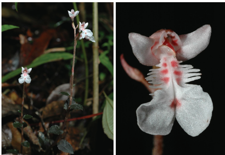
Fig. 2. Odontochilus nanlingensis (L. P. Siu & K. Y. Lang) Ormerod.