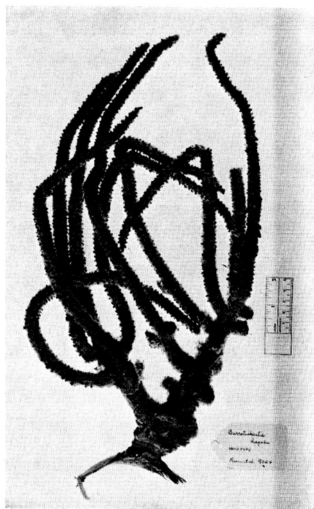
1. Inflorescence of Burretiokentia hapala , branches partially trimmed, showing woolly rachillae ( Moore et al. 9324 , BH).

dissection of one fruit recovered from a fallen inflorescence, together with additional immature fruits from Lavoix 25 , show that the correct genus for this striking palm is the previously monotypic Burretiokentia . This second species is readily distinguished from Burretiokentia Vieillardii by the woolly (Fig. 1) rather than glabrous (Fig. 2) rachillae; by the fruit (Fig. 3a) which is ovoid and attenuate toward the apex (when not perfectly mature) rather than nearly globose when fresh (Fig. 4o); and by the endocarp and seed with the adaxial keel higher than the lateral ridges (Fig. 3b–d) rather than lower (Fig. 4q, s).