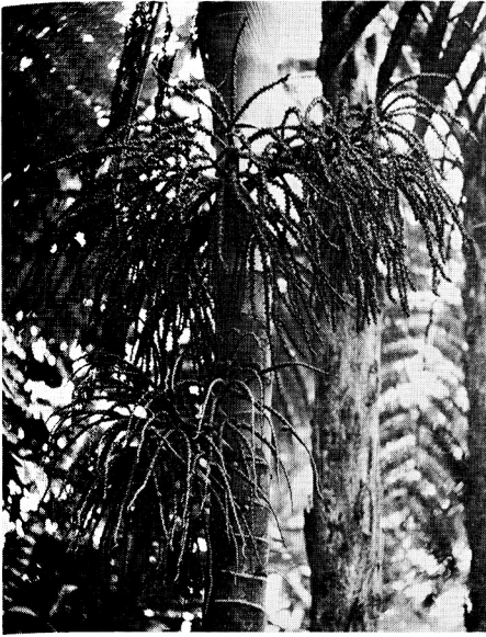
2. Burretio kentia Vieillardii with inflorescences in several stages (Moore et al. 9334).