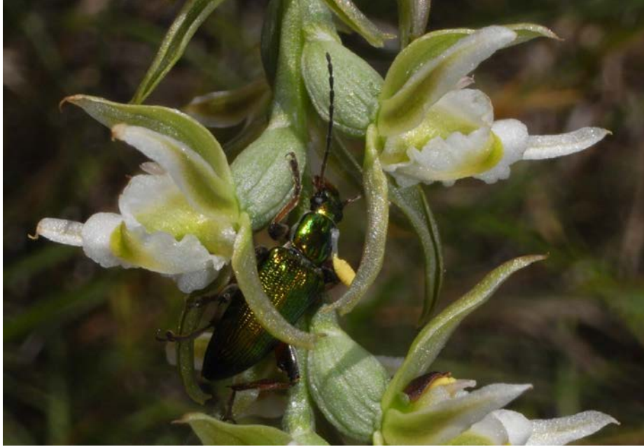
Prasophyllum odoratum with pollinator

Orchids are a wondrous plant, not just because of their beautiful and unusual flowers. Their method of reproduction seems so unlikely that it could never possibly succeed, but despite my disbelief, is very successful. The more we learn about orchids and their reproduction, the more amazing we find these beautiful plants.