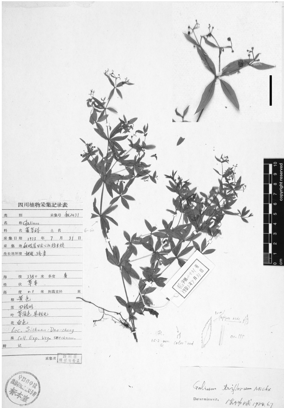
Figure 5. Galium sichuanense Ehrend. Holotype (Coll. Exp. Veg. Szechuan 2431, PE), with close-up of inflorescence, flowers, and young fruits inset at top right. Scale bar = 10 cm.

and the elongate, curved mericarps. Its taxonomic placement within Galium is also quite uncertain.