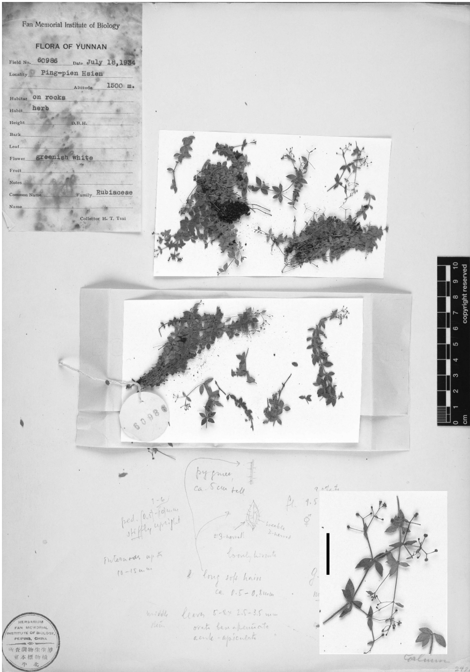
Figure 4. Galium rupifragum Ehrend. Holotype (H. T. Tsai 60986, PE), with close-up of inflorescence and flowers inset at bottom right. Scale bar = 10 cm.

Distribution and habitat. Galium rupifragum is known only from the mountainous type locality in Yunnan Province (Ping-pien Hsien), where it grows on rocks at 1800 m elevation.