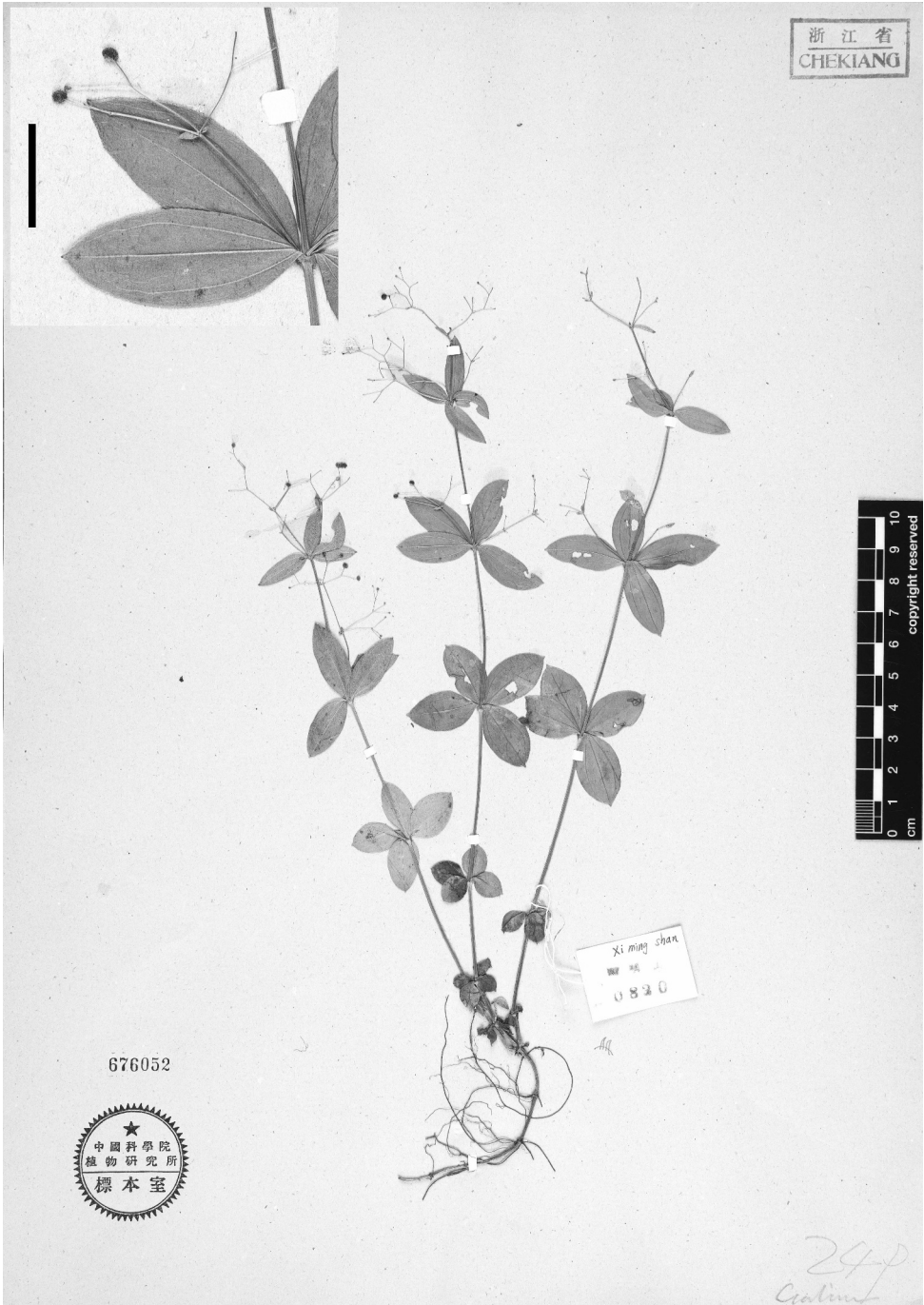
Figure 2. Galium chekiangense Ehrend. Holotype (s. coll. 0830, PE), with close-up of inflorescence and young fruits inset at top left. Scale bar = 10 cm.

Haec species inter congeneros ad Galium sect. Platygalium W. D. J. Koch pertinentes quoad corollam in dimidio basali connatam G. platygalio (Maxim.) Pobed. et G. maximowiczii (Kom.) Pobed. similis, sed ab eis floribus minoribus atque foliis 4-nis tantum verticillatis differt.