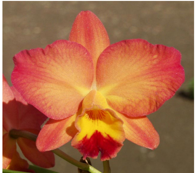
Pot. Mem. Jim Nicou x Slc. Circle of Life (Sunset Valley Orchids)

Fred will also bring plants for sale and will be supplying a great selection of plants for door prizes!