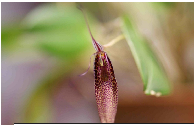
Rstp. antennifera 'Paprika' – Vera Lee & Mali Rao

Winter is cold, so protect plants from drafts. If buds start falling off of a Phalaenopsis inflorescence the first thing to suspect is a drafty window (second thing is ethylene gas from a nearby heater). Do not put plants close enough to a window to touch the glass!