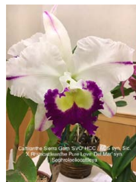
Cattlianthe Sierra Gem 'SVO' HCC / AOS syn. Slc. X Rhyncholaeliocattleya Pure Love 'Del Mar' syn. Sophrolealiocattleya