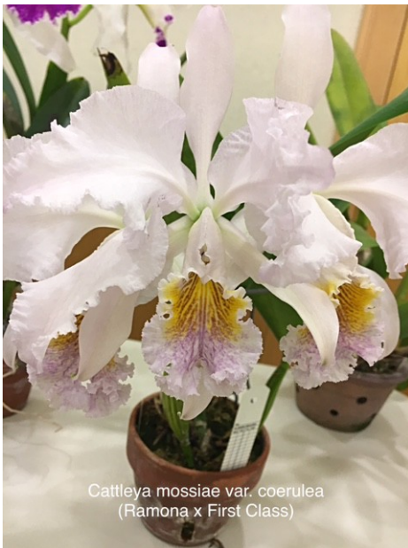
Cattleya mossiae var. coerulea (Ramona x First Class)