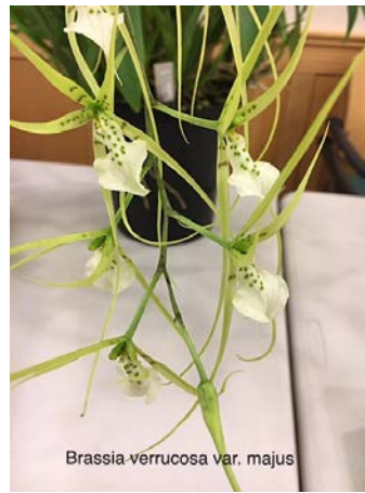
Brassia verrucosa var. majus