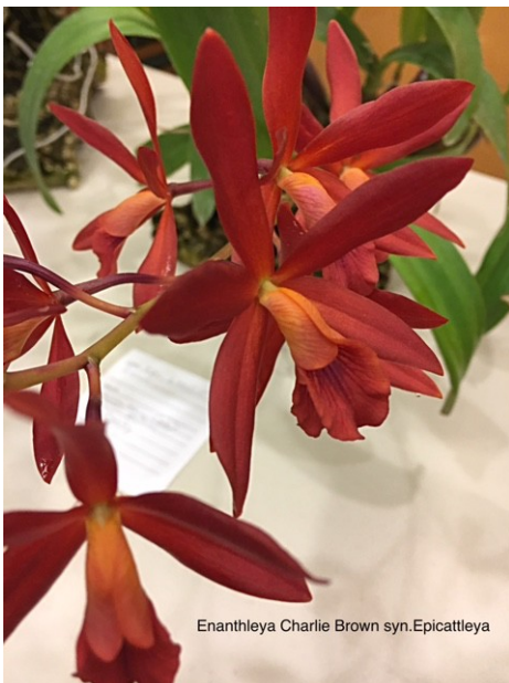
Enanthleya Charlie Brown syn. Epicattleya