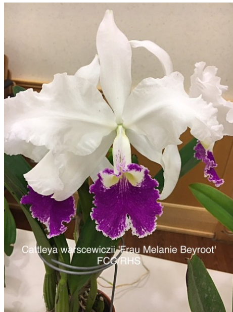
Cattleya warszewiczii 'Frau Melanie Beyroot' FCC/RHS