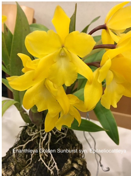
Enanthleya Golden Sunburst syn. Epilaeliocattleya