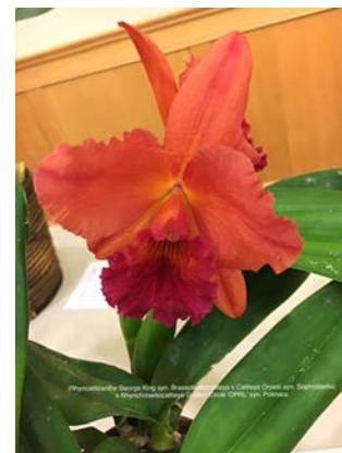
Rhyncholaeliocattleya Golden Circle 'OPRL' syn. Potinara