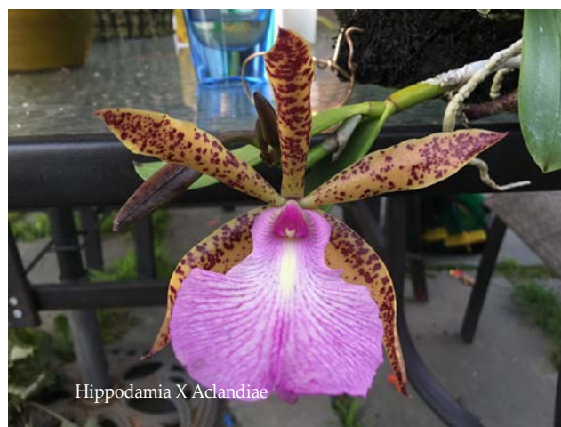
Hippodamia X Aclandiae