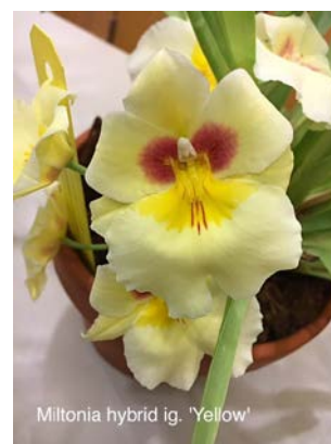
Miltonia hybrid ig. 'Yellow'