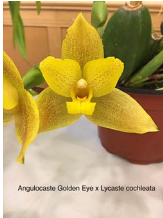
Angulocaste Golden Eye x Lycaste cochleata