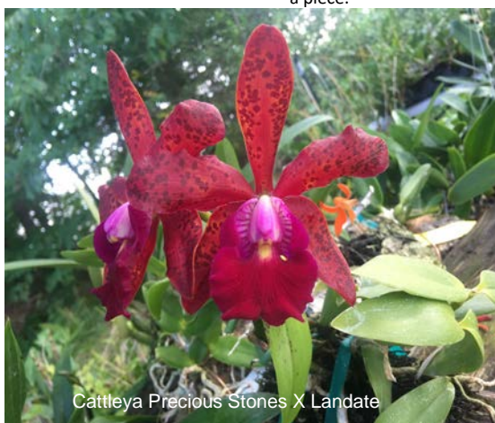
Cattleya Precious Stones X Landate