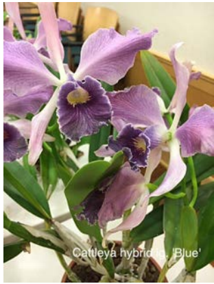
Cattleya hybrid 'Blue'