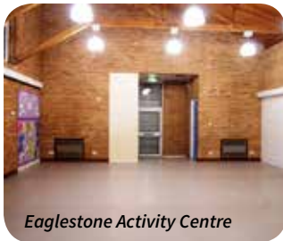
Eaglestone Activity Centre