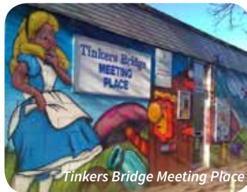
Tinkers Bridge Meeting Place

Woughton Community Council manages four community centres across the parish; Eaglestone Activity Centre, Netherfield Meeting Place, Tinkers Bridge Meeting Place and Coffee Hall Meeting Place. These centres are used for a wide variety of things – meetings, faith groups, sports, youth activities, dog training and all sorts of parties (including space suitable for bouncy castles!). We also currently have space for pre-schools or playgroups if you are looking for affordable spaces to provide these activities.