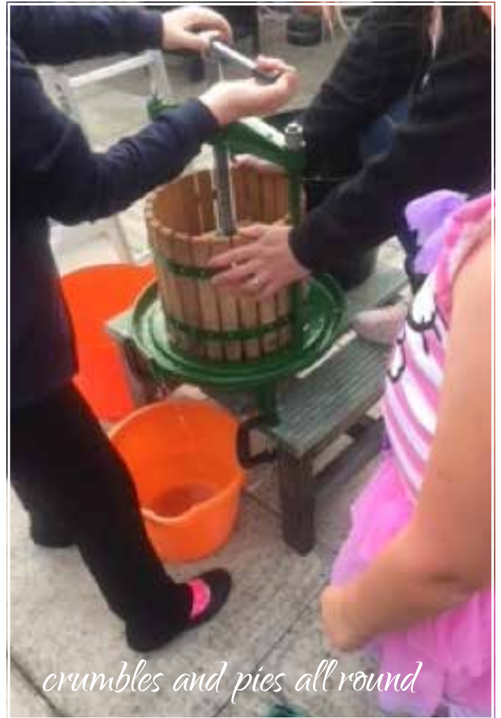
crumbles and pies all round

Watching the excitement when children got to shred the apples and then squeeze them to see the juice coming out was great – a reminder that our area has LOTS of produce just waiting to be scrumped! With apples, blackberries, sloes and lots of other stuff growing it is well worth a wander round with a bucket and something to hook things – crumbles and pies all round.