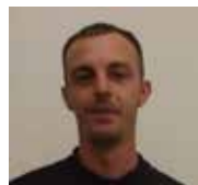
Vinny Haddock Snr. Landscape