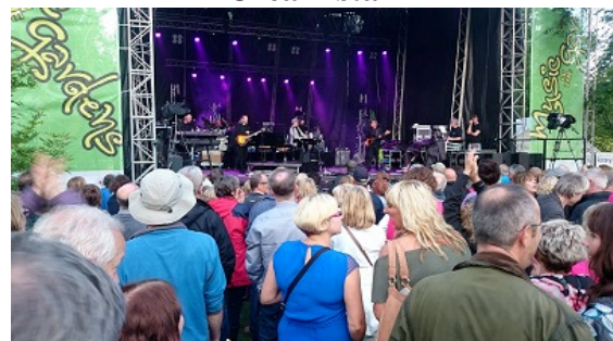
The Band on stage