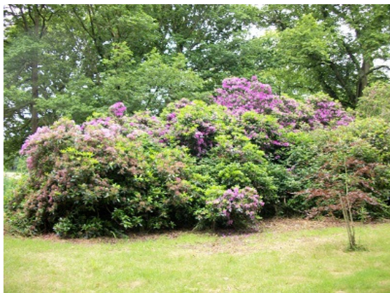
Wortley Hall Gardens in Bloom

The pictures below give a flavour of the day.