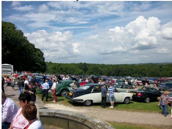
Some Vintage / Classic Vehicles