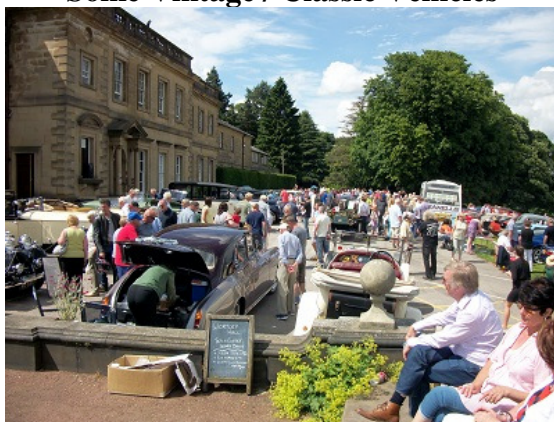
More Vintage / Classic Vehicles