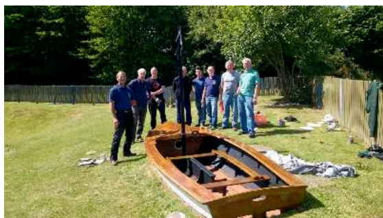
The Boatary Gang

On Saturday 25 th July, members of the club visited Monteney School to spruce up the boat installed at the school last year. A number of members turned out to help and the refurb was completed faster than was initially envisaged – thanks to all those who helped.