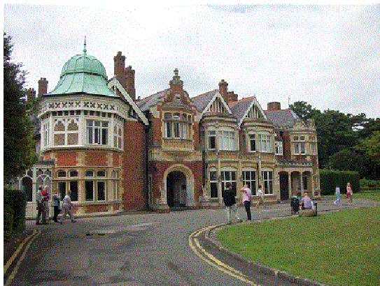
Mansion at Bletchley

In recent years the Bletchley Park has been returned to the way it would have looked in the 1940's. Bletchley Manor, a beautiful 19th century stately home sits within superb grounds complete with its own lake, is itself worth a visit.