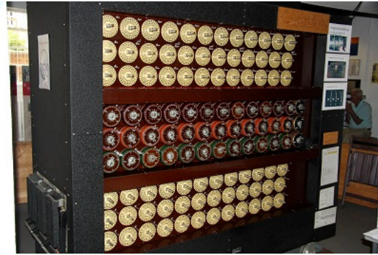
Working Model of the "Bombe"

However, the story of Bletchley was brought to life through interventional exhibits and demonstrations presented in a number of the original huts in which intercepted enemy communications were deciphered and intelligence reports produced.