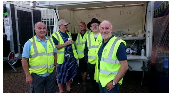
Wortley Rotarians at the Strawberry & Cream stall