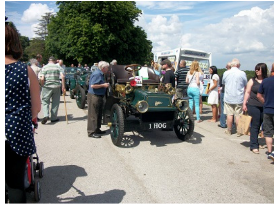
Closer Look at the exhibits