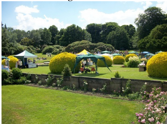
Stalls on the Hall Gardens