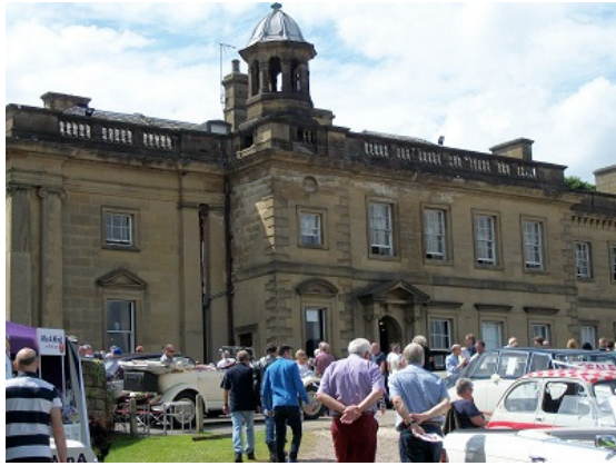
Wortley Hall Front