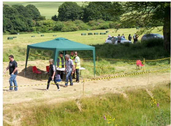
The Main Entrance