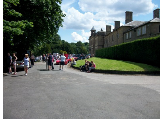
From the other end of the Hall Front