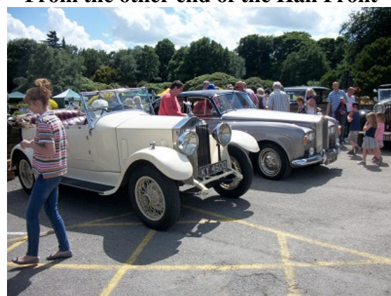
More Vehicles close up