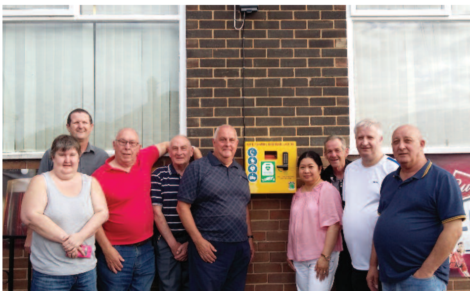
Members of the Garforth Working Mens Club Committee with the defibrillator machine which was recently installed outside the club

Garforth Working Mens Club in Leeds has installed a Community Public Access Defibrillator (CPAD) on the outside of its premises.