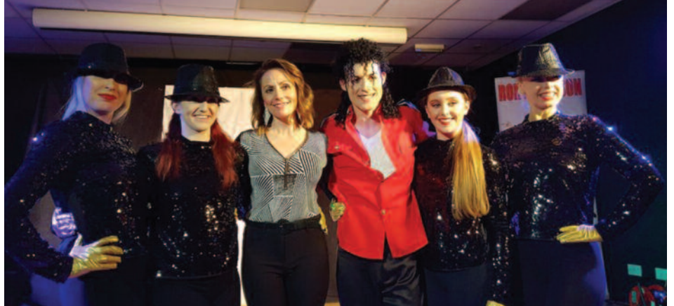
The club aims to be the premier tribute act venue on the South Coast

popular at the club and we have golf, fishing, and pigeon racing sections."