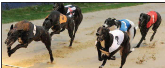
There will be a total of 14 races during Dransfields CIU Racenight