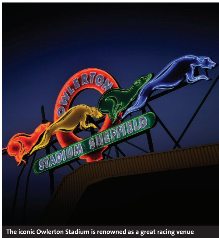
The iconic Owlerton Stadium is renowned as a great racing venue