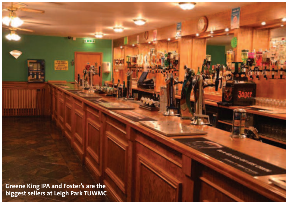
Greene King IPA and Foster's are the biggest sellers at Leigh Park TUWMC

With so much going on within its walls, it's no wonder that Leigh Park TUWMC continues to be such a vital part of its local community.