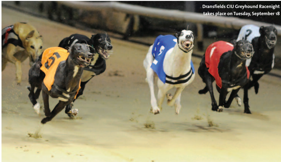
Dransfields CIU Greyhound Racenight takes place on Tuesday, September 18

Sheffield's iconic Owlerton Stadium will be hosting the Dransfields CIU Racenight on the evening of Tuesday, September 18 (the first race goes off at 6.22pm).