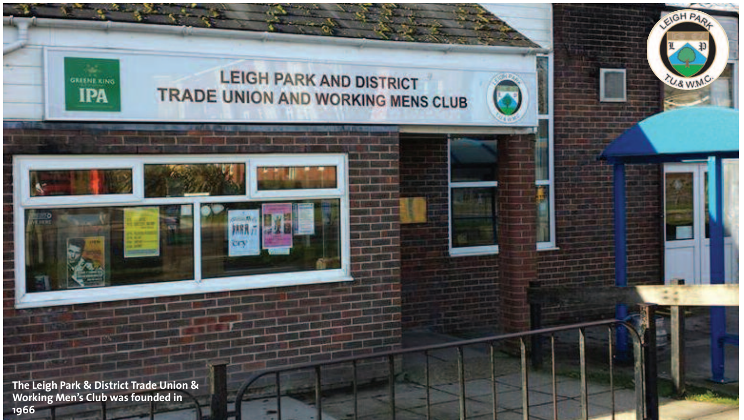
The Leigh Park & District Trade Union & Working Men's Club was founded in 1966