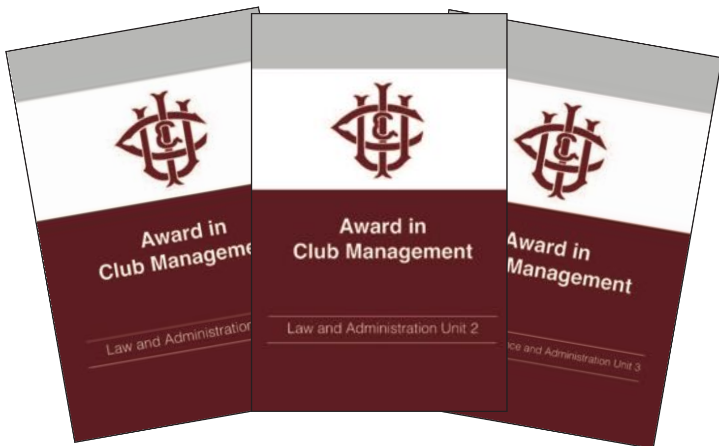
Candidates are given a workbook for each unit which they can take back to their clubs with them to act as a reference

Head Office will be rearranging new dates for the ACM day courses at various clubs across the country for the second half of 2022 and 2023, so look out for further information in upcoming issues of Club Journal .