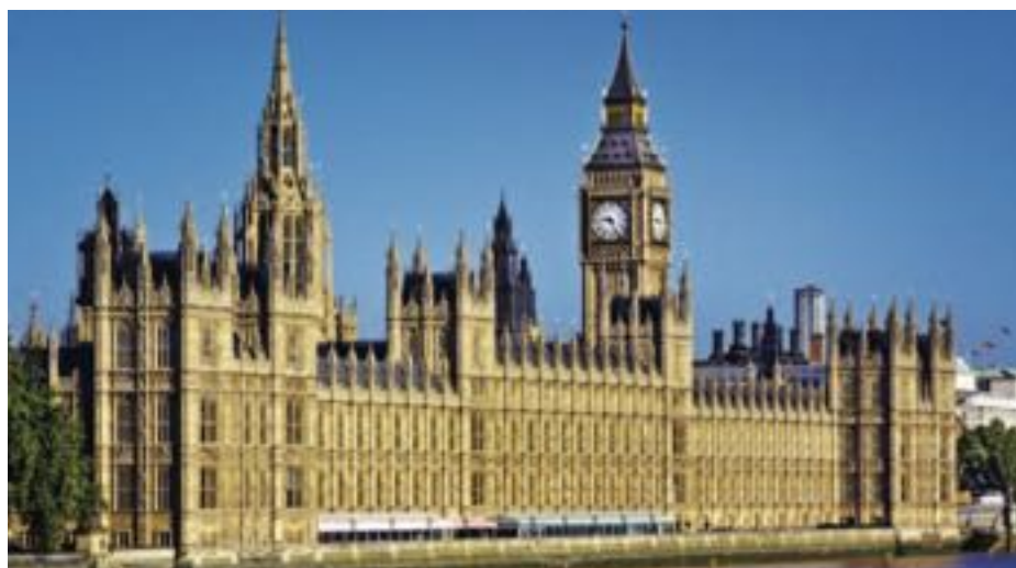
The Government unveiled the Energy Bill Relief Scheme for businesses on September 21 and promised to review the scheme within three months

New support for households, businesses and public sector organisations facing rising energy bills was unveiled by the Government on September 21.