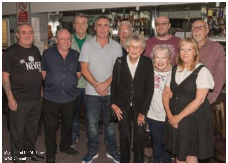
Members of the St. James WMC Committee

Indeed, even the minor matter of a global pandemic could not shake the Committee's commitment to their club as several members rolled their sleeves up and got to work on refurbishments and improvements during the Government-enforced