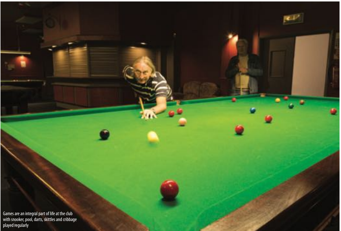
Games are an integral part of life at the club with snooker, pool, darts, skittles and cribbage played regularly

“There’s another bingo session on a Thursday night and that always has a really good turnout and provides a nice boost to trade on a weekday night.