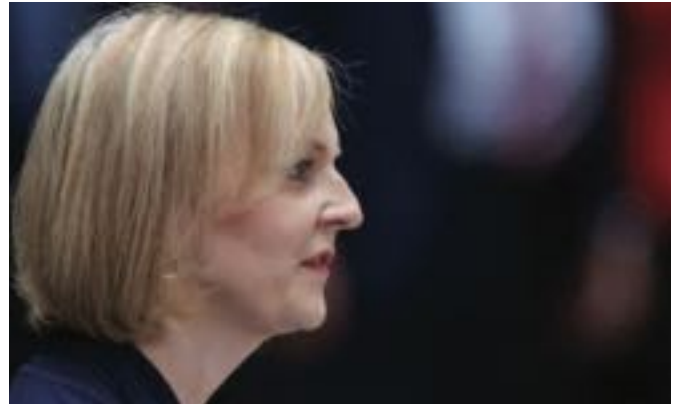
Prime Minister Liz Truss announced the scheme in September

The Government says it will work with suppliers to ensure all their customers in England, Scotland and Wales are given the opportunity to switch to a fixed contract/tariff for the duration of the scheme if they wish, underpinned by the Energy Bill Relief Scheme support.