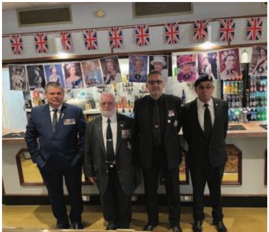
Four former members of the Armed Services were among the many people who attended Maidstone Working Men's Club & Institute on Monday, September 19

Heartfelt thanks were extended to the Queen for all of her dedication, strength and dignity that she showed throughout her life and several services veterans attended the club wearing their service medals.