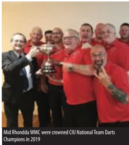
Mid Rhondda WMC were crowned CIU National Team Darts Champions in 2019

"We are actively asking more clubs to enter teams and individuals across the many categories of games and