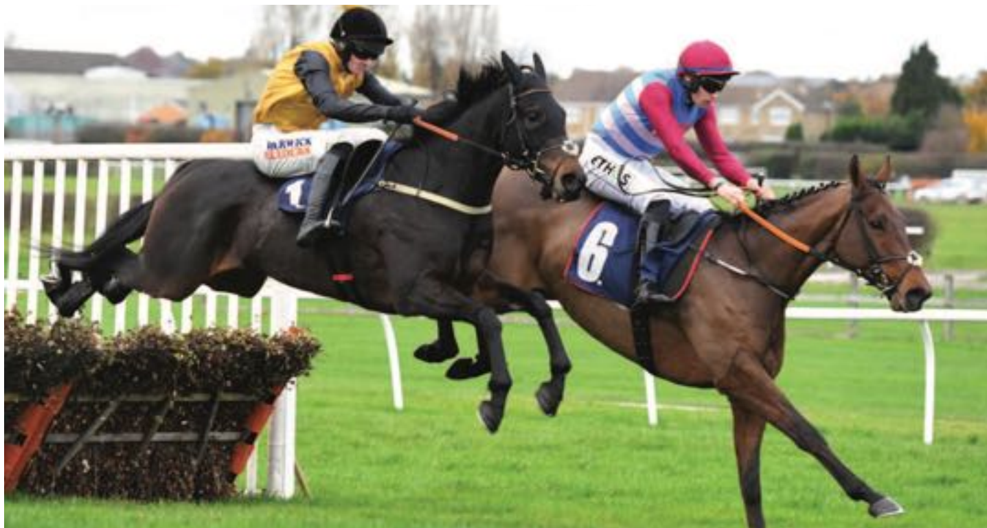
Dransfields CIU National Charity Raceday will take place on Saturday, November 12 at Wetherby Racecourse in Yorkshire