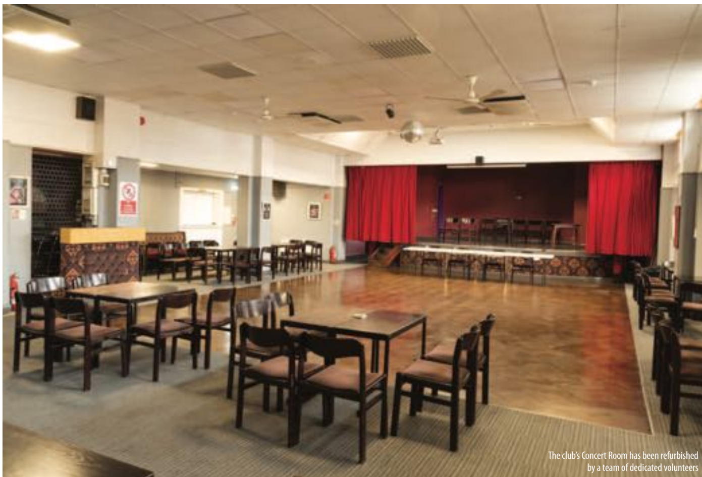
The club's Concert Room has been refurbished by a team of dedicated volunteers

St. James Working Mens Club 2 Weedon Road Northampton NN5 5BE 01604 751686 Branch: South East Midlands