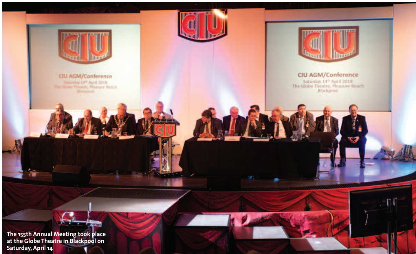
The 155th Annual Meeting took place at the Globe Theatre in Blackpool on Saturday, April 14