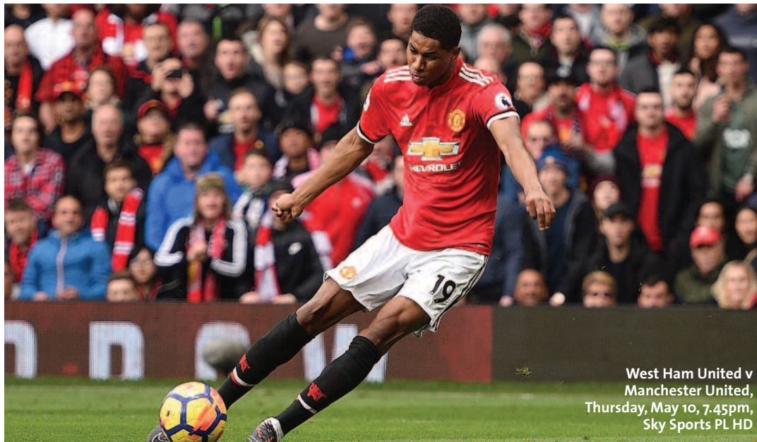
West Ham United v Manchester United, Thursday, May 10, 7.45pm, Sky Sports PL HD

Scottish Premiership: Hibernian v Rangers