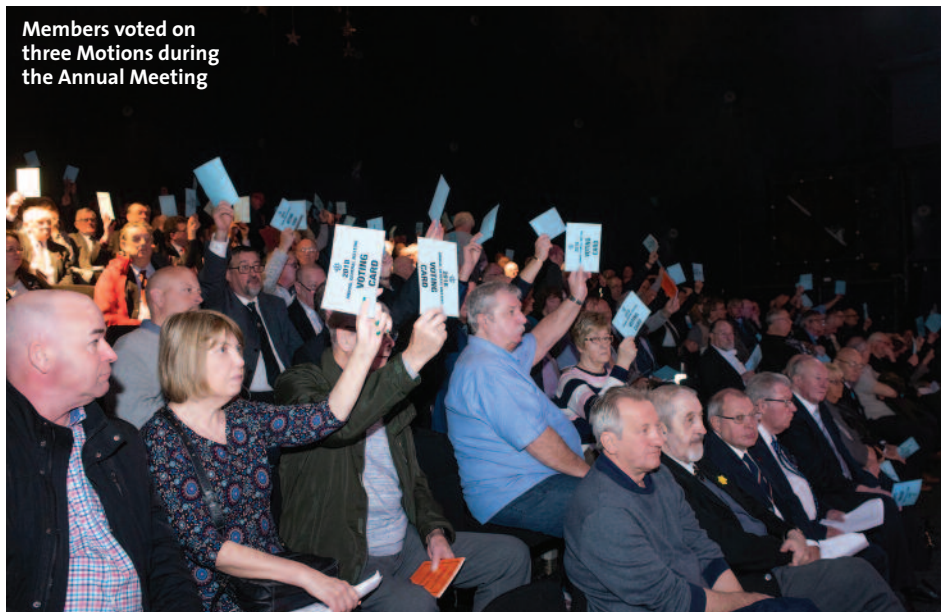
Members voted on three Motions during the Annual Meeting

"You may as well talk to a brick wall! So, I don't know why we're paying money into them. Please vote against it, ladies and gentlemen. Keep it to your Branches."