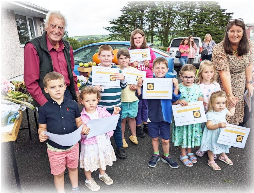
Everyones a winner