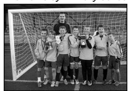
Crewe Alex NPower Cup winners 2011!

The Berkeley school football team enjoyed even more success on Tuesday by winning the Crewe Alex NPower Cup for the first time in the school's history. After winning their group on the qualifying day they went into the finals day full of confidence.