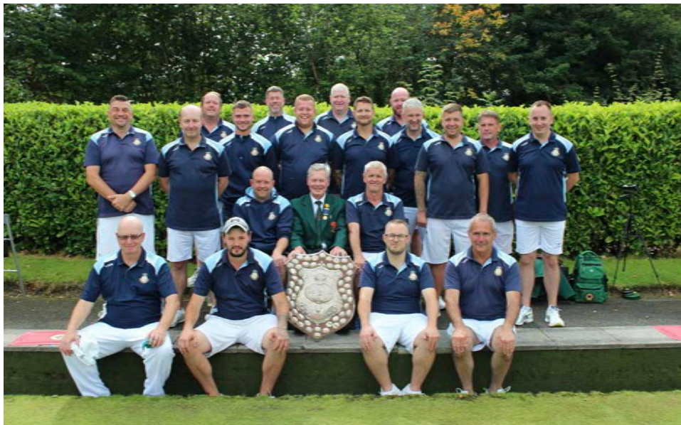
Carruthers Shield Winners RTB Ebbw Vale