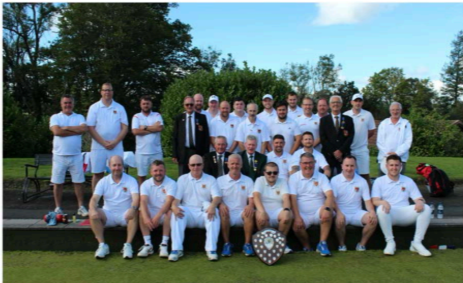
County Champions Monmouthshire CBA