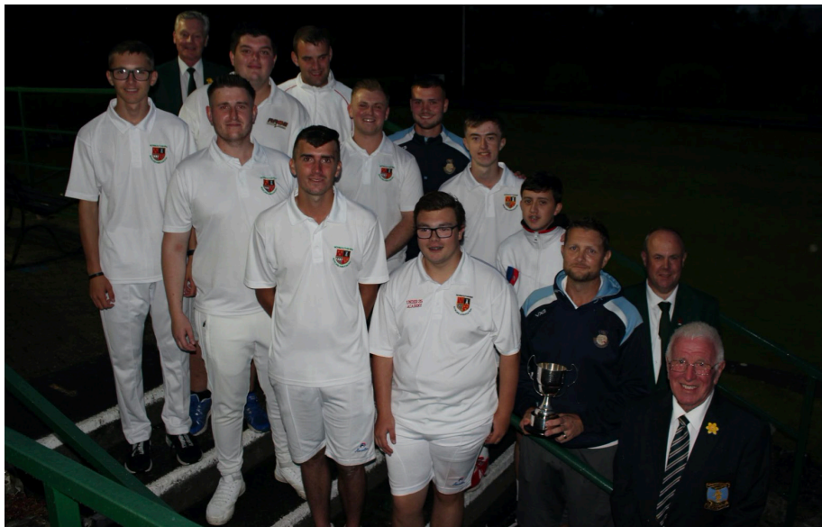
Super 10 Champions Monmouthshire CBA