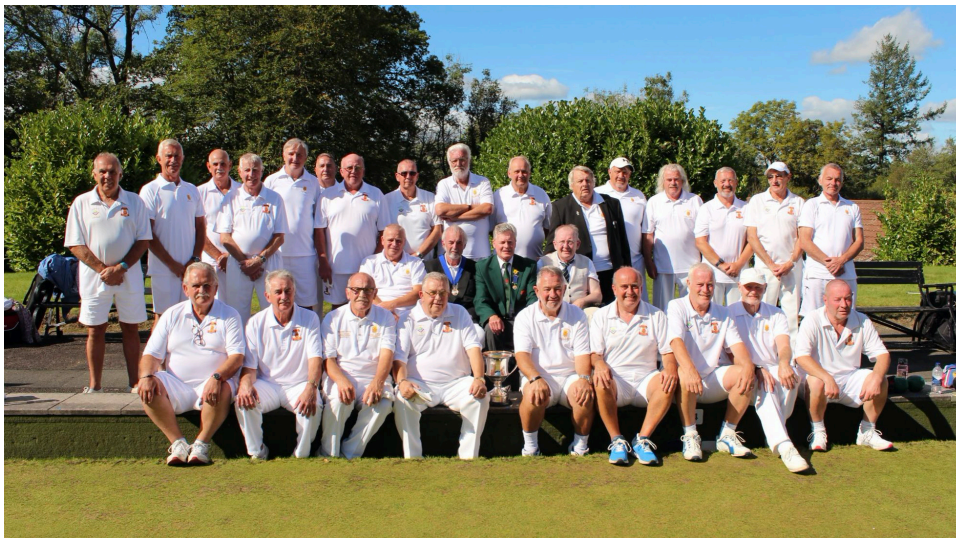
Senior County Champions South Glamorgan CBA