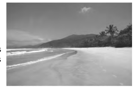
JUNE - Whitehaven Beach, Whitsunday Islands, Queensland, Australia

Just three hours south of Rio de Janiero, Ilha Grande is a small island home to the jawachingly beautiful Praia de Lopes Mendes. To get to the beach is quite an undertaking, but well worth the effort – you have to hike through Atlantic forests thick with hummingbirds, butterflies, tropical flowers and waterfalls with Pygmy and Holy monkeys running everywhere. With sand as white and as soft as flour, the beach of Lopes Mendes is irresistible. The island was discovered in 1502 but today preservation is the word with roads only existing in the island's main village.