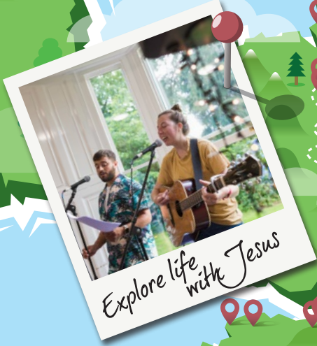
Explore life with Jesus