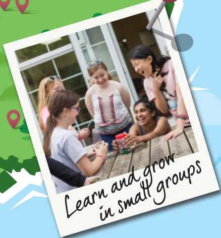
Learn and grow in small groups