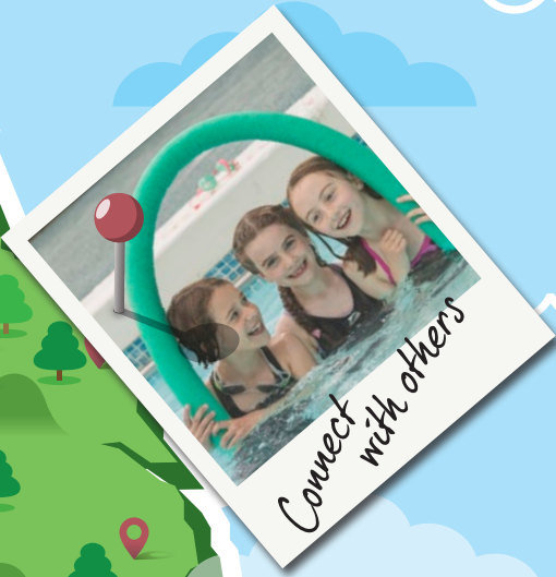
Connect with others