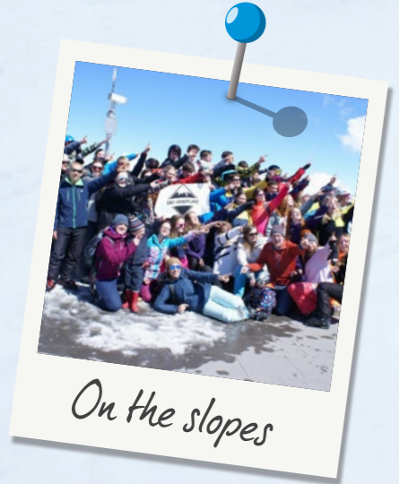
On the slopes