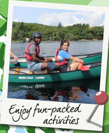
Enjoy fun-packed activities