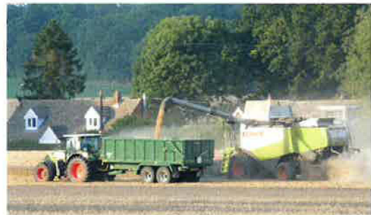
Harvesting in the 21 st century

In 2011, the population of Quendon and Rickling was recorded as 587, which shows a gradual increase of just 60 since the 1901 Census. However, the lives of the residents have changed in many ways. New skills in technology, trade and commerce are listed under 'Occupation', and very few of the residents now work in the village. Although surrounded by farmland, modern farming techniques and practices negate the need for a large local workforce. We have lost most of the trades and services enjoyed by past residents, but hopefully we have not lost their spirit and sense of community. Our village has evolved over centuries and will continue to do so. The Village Plan is our opportunity to contribute to its future.