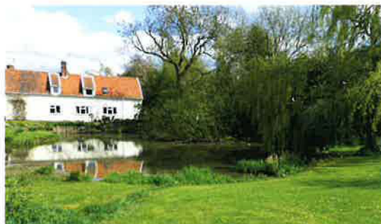
Dell Pond, Rickling Green, 2015.

An interest was also shown in future environmental projects; ideas such as the restoration and development of local ponds, a woodland trail and bulb planting were well supported. Better allotment facilities also attracted some interest and in Question 10, people were asked if they would be willing to help with these initiatives. The results show that there is both an interest in, and a will to engage with the local environment and this enthusiasm should be encouraged and used for the benefit of the village as a whole.