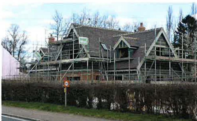
Two developments along the Cambridge Road, 2015

278 residents answered question 29, of which 56% felt that there is sufficient publicity given to planning applications in Quendon & Rickling. Further questions went on to determine the number and type of development that people would like to see in the village. Question 33 asked where new developments should be sited. Of the 170 respondents to this question, 99% would like them to be within the village boundaries. 95% also considered infill plots as suitable sites for development.