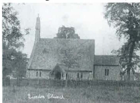
Quendon Church, 1909.

The Church of All Saints, Rickling, dates back to the 13 th century and probably stands on a pre-Conquest site. Later 14 th century additions include the first two stages of the west tower, the third stage dating back to the 16 th century. The Church of St Simon & St Jude, Quendon, is also a 13th century building. It was altered in the 16 th century and further restoration and building work was carried out in 1861. The tower was hit by a lightning strike in 1941 and was later pulled down. It was replaced by the current tower and three bells in 1963. Details of other listed buildings in the village can be found on the British Listed Buildings website 1 .