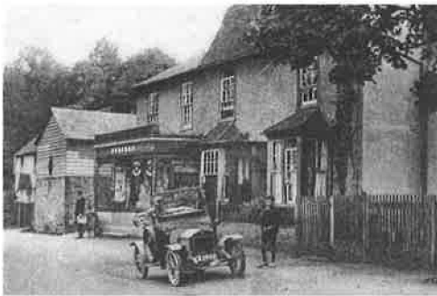
Mumford Stores, 1920s.