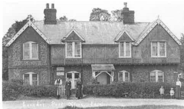
Old Post Office, c.1906.

Quendon windmill would have been a prominent local landmark. First mentioned in 1678, the original Post Windmill was blown down in 1795 and replaced by a Tower Windmill in 1805. This in turn was demolished c1900.