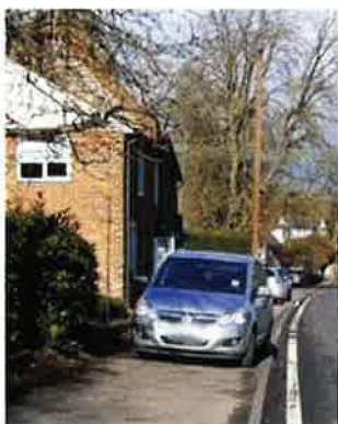
Pavement obstructed along Cambridge Road, Quendon.