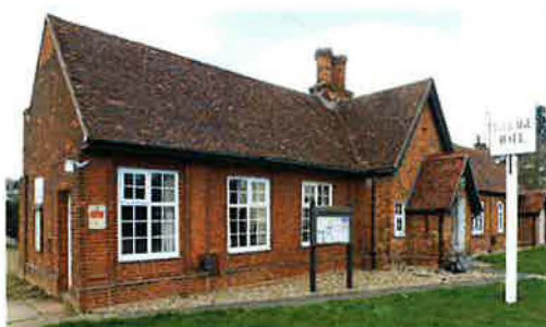
The Village Hall, 2015.