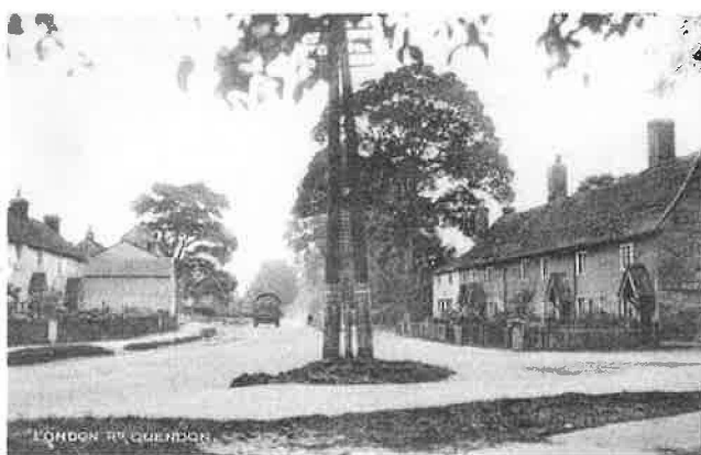
Junction of what is now, Rickling Green Road and Cambridge Road.

The 1870s saw the beginning of the decline in agriculture. The village population had increased to 708, with new trades and professions appearing on the census, but farming was still the main employment, with 129 men listed as agricultural labourers. By 1901, a population of 527 reflected the general move away from the land to the towns and cities. The agricultural workforce now totalled just 37, with 5 stock-keepers and a cowman listed. By the beginning of the 20th century, the village had witnessed some radical changes in society. Records show the population as 534 in 1931, rising slightly to 557 in 1951. Although still a rural community, the majority of the workforce no longer worked on the land.