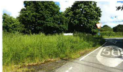
Junction of Belcham's Lane with the B1383.