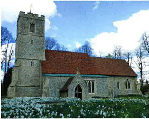
All Saints Church, Rickling, 2015

As long standing institutions within our community, the questions in this section sought residents' views on the Church and local schools. 73% of respondents value the part the Church plays in village life, a further 64% being aware of the role of the Friends of Rickling & Quendon Churches. Rickling School is also a valued part of our community with 97% of the respondents confirming this.