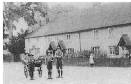
Boy Scouts and Scout Master in Rickling, 1915.

In the early 20 th century, a variety of clubs could be found in the village. A Mothers’ Union, Women’s Institute, Men’s Society and Scouts held regular meetings, with a Horticulture Society and Flower Club catering for gardening enthusiasts. In the early 1900s a Coal Club and Shoe Club were set up, a weekly membership acting as a savings scheme for people. Sports clubs were also popular. In 1883, the village had an Archery and Tennis club, and the Tennis Club was