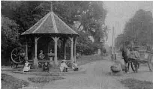
The Pump at the beginning of the 20th century.

Another familiar building is the Village Hall, which began life as a Reading and Coffee Room. A ‘Grand Bazaar’ was held in the grounds of Quendon Hall to raise funds for its construction. 10 Later that year a ‘Fancy Bazaar’ was held to raise funds for the building of the Parish Room. The curate of Rickling believed this ‘would be a boon to inhabitants’ and could also be used for religious and other purposes. 11