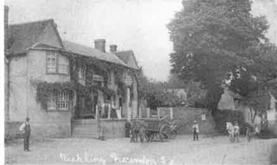
Coach and Horses, c. 1905