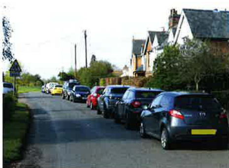
Parking along Rickling Green Road

This section also looked into the role the airport plays in the life of the village as both a transport hub and employer. Although the airport has a high profile in the area, it employs very few residents and plays a small role as a transport hub for commuters. Most journeys made from the airport are for leisure, a few people travelling several times each year, but less frequently for the majority of travellers.