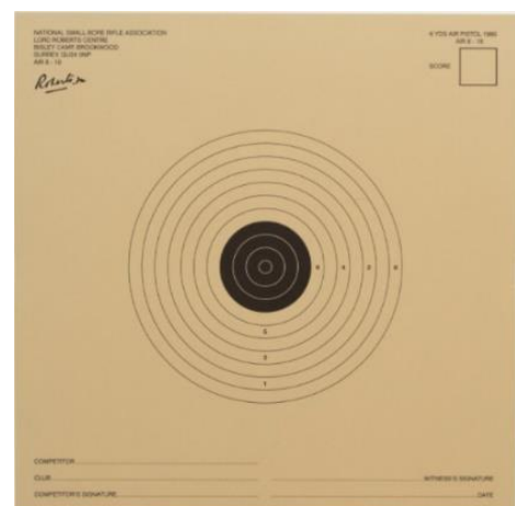
The NSRA Air8 Target: Recommended for introducing Scouts to Target Air Rifle

Please feel free to forward to any other Scout Troop you feel may have an interest.