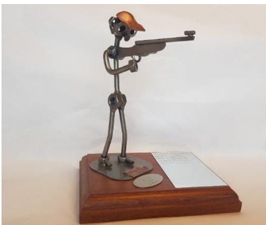
The Team Trophy

Email us: air.rifle@surrey-scouts.org.uk