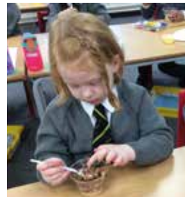
TASTY SCIENCE Page 14