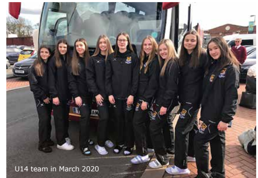
U14 team in March 2020

Congratulations to our U14 Netball squad who have been awarded North-West Netball's Golden Globe. Last school year, the team finished third in England at the National Netball Finals.