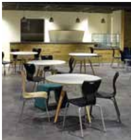
NEW SIXTH FORM BUILDING OPENS Page 5