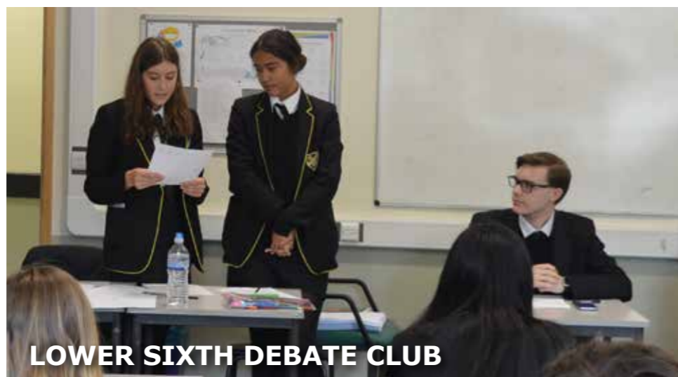
LOWER SIXTH DEBATE CLUB

The Lower Sixth Debate Club has met fortnightly with the monarchy the first in a varied series of topics. The club gives students an opportunity to develop their communication and debating skills, as well as utilising their research and case building ability.