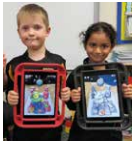
CHILDREN IN NEED Page 13