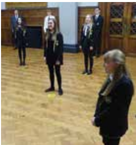
VIRTUAL CHRISTMAS CELEBRATIONS Page 2