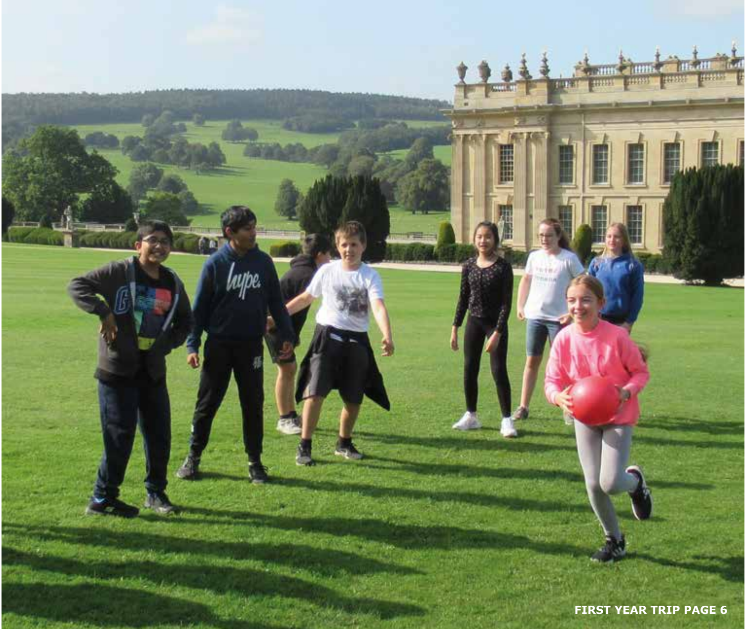
FIRST YEAR TRIP PAGE 6