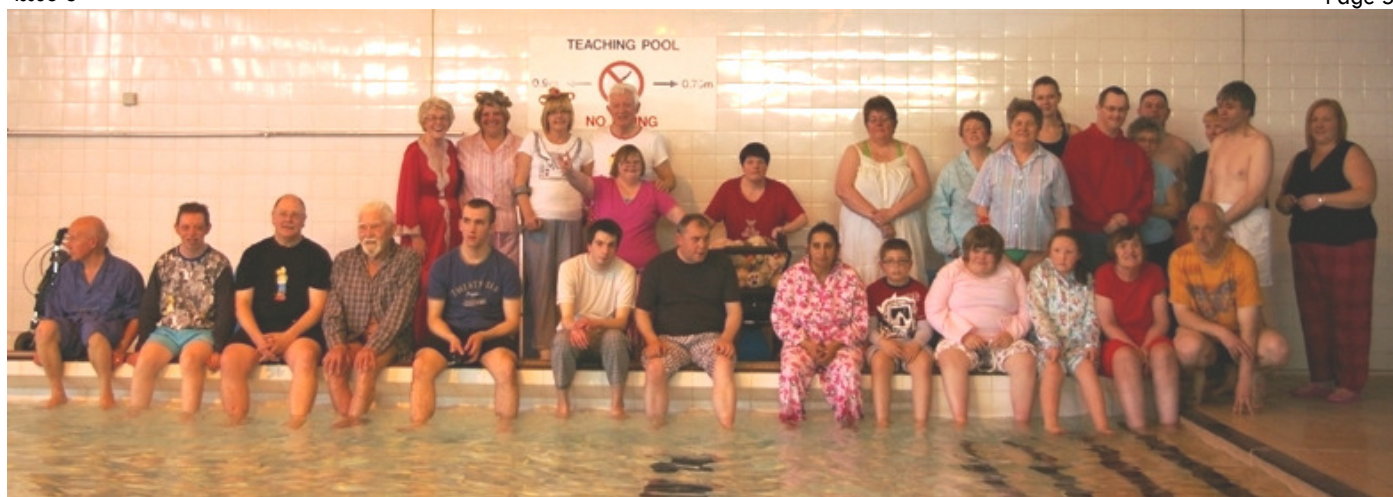
Above: Forth Valley's Dolphin swimming club pictured in their pyjamas before their sponsored swim at the Grangemouth Sports Complex