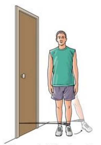
Knee stabilization: B