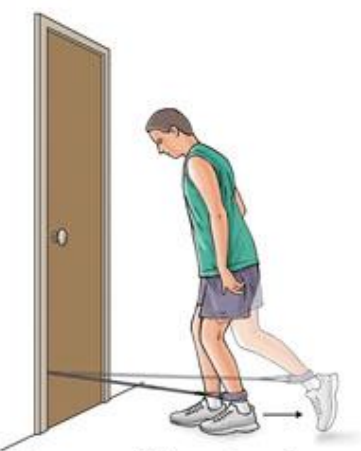
Knee stabilization: A