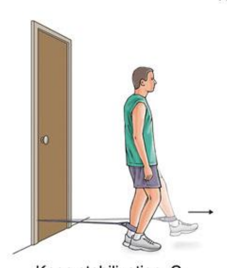
Knee stabilization: C