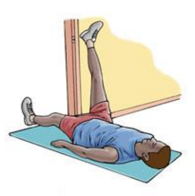
Hamstring stretch on wall