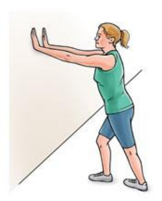
Standing calf stretch