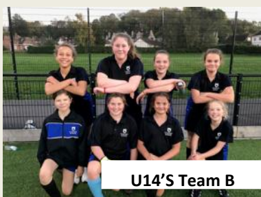
U14'S Team B