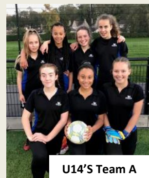
U14'S Team A