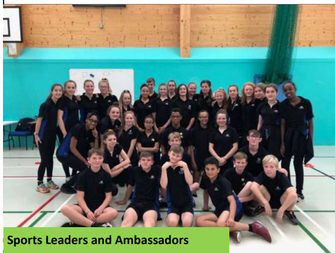
Sports Leaders and Ambassadors