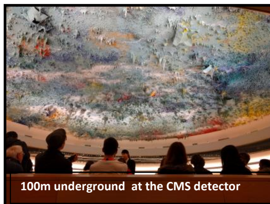
100m underground at the CMS detector