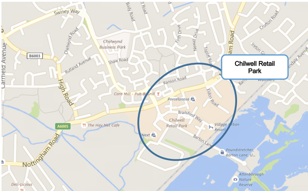
Figure 3. Location Plan – Chilwell Retail Park