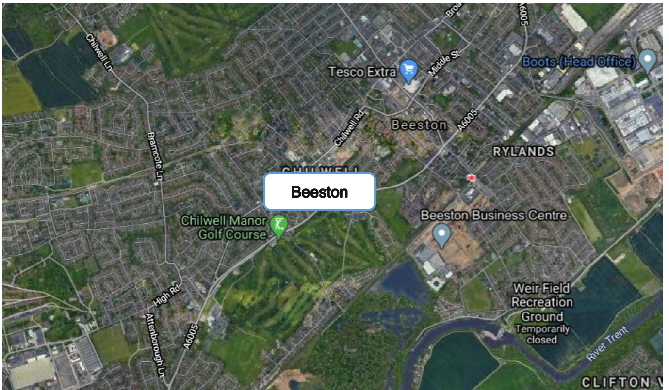
Figure 1. Location Plan

Following the torrential downpour, 32 business and 57 residential properties throughout Beeston suffered internal flooding.