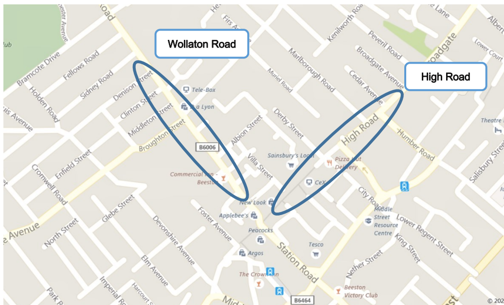
Figure 2. Location Plan – High Road and Wollaton Road