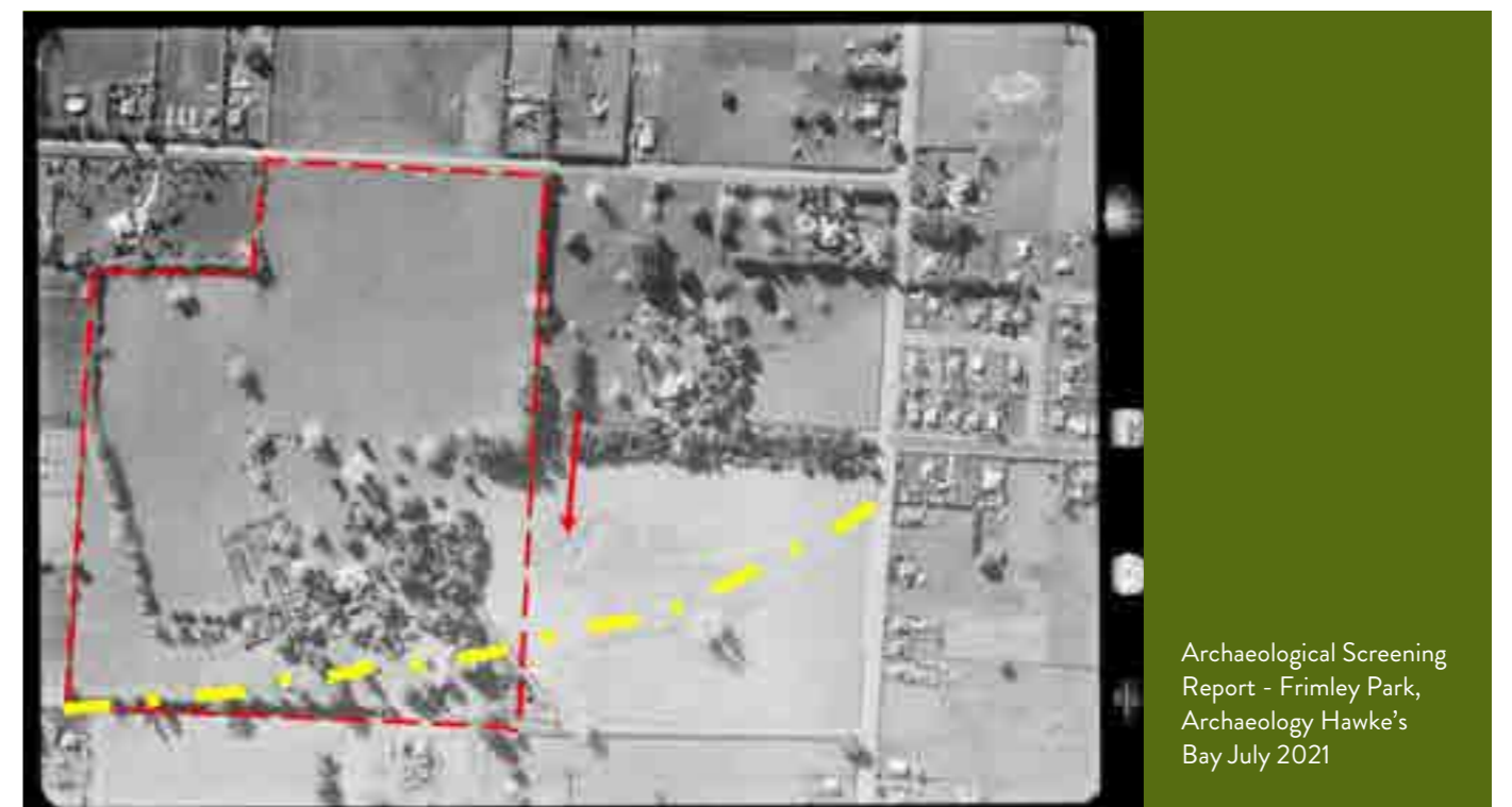
Archaeological Screening Report - Frimley Park, Archaeology Hawke's Bay July 2021