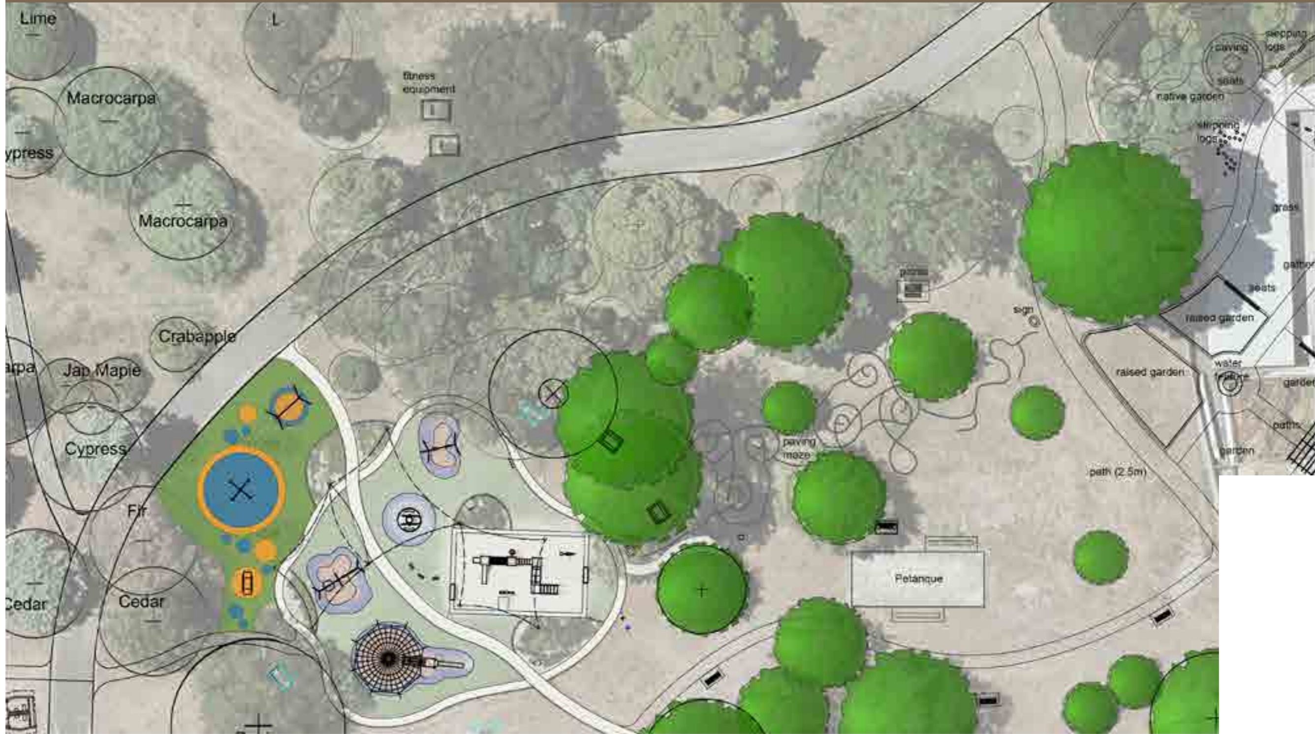
1 PLAYGROUND LOCATION Scale: 1:250