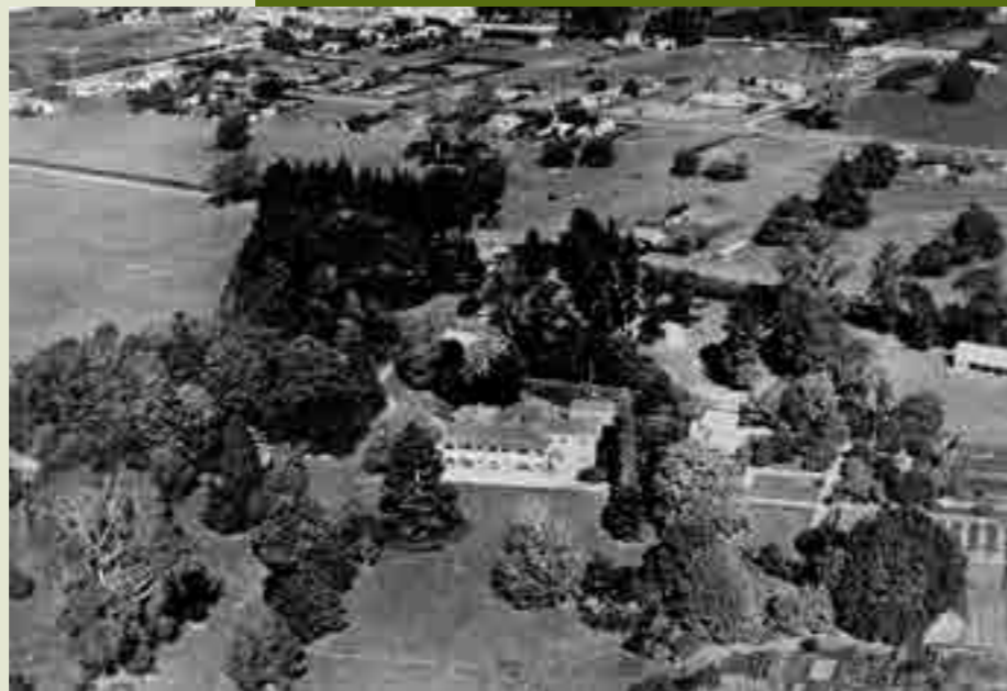
Frimley Homestead, circa 1890