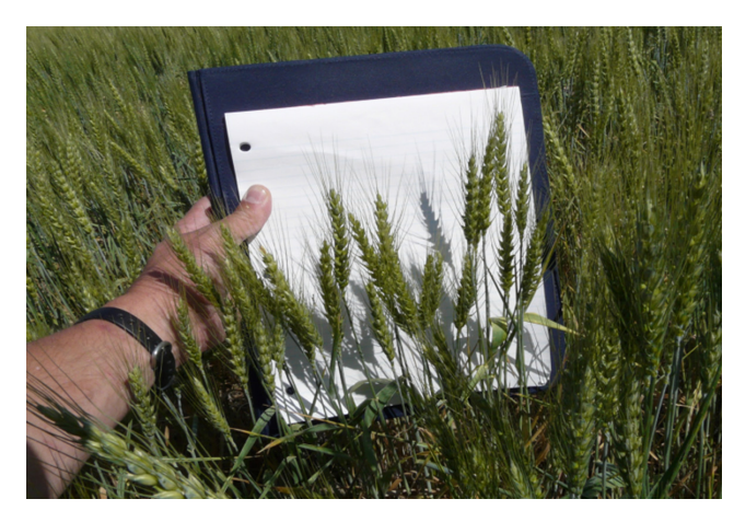
Figure 6. Wheat productivity within 40 feet leeward of a windbreak.

Assistance for establishing or renovating windbreaks can be found at your local MSU Extension office or Natural Resources Conservation Service (NRCS) office. MSU Extension can offer technical assistance and facilitate contact with the Montana Department of Natural Resources and Conservation (DNRC) 'Conservation Nursery' for tree and shrub seedling purchases that require a conservation plan. Seedling orders are best placed in the fall to ensure seedling availability with an April delivery date for planting. NRCS can also offer technical assistance and may have cost-share opportunities, as well as at-cost weed barrier fabric and planting equipment that can be borrowed free of charge.