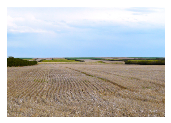
Figure 4. Well-spaced single-row crop windbreaks.