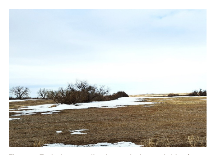
Figure 5. Typical snow collection on the leeward side of a windbreak.