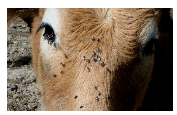
Face flies massed on the face of a dairy cow.

this could be an alternative to conventional methods and aid in reducing insecticide resistance. However, more research must be conducted to determine garlic's potential as a fly control method.