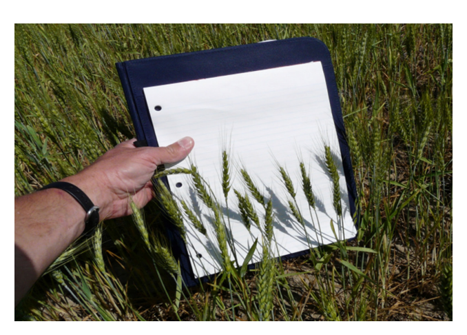
Figure 7. Identical crop and timing 200 yards from Figure 6 without a windbreak protection.

Peter Kolb is the MSU Extension Forestry Specialist.