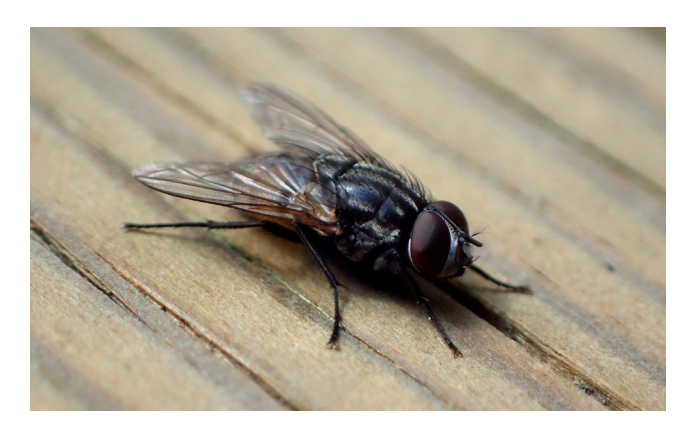
Face fly (Musca autumnalis)

Providing garlic to cattle as a method of fly control has been a popular discussion for the past three to five years. However, minimal research has been conducted on the use of garlic as a fly control option. One study in Canada did observe some positive impacts from feeding garlic and reducing defensive behaviors and fly abundance in cattle (Durunna and Lardner, 2021). Therefore, there is optimism