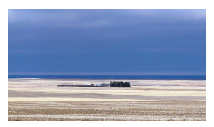
Figure 1. A typical "tree island" shelterbelt in central Montana.

For home space protection, three to five rows of shrubs and trees typically need to be planted on two to three sides of the homestead to offer maximum protection from prevailing winds (Figures 1 and 2). Shelterbelt design should create a wedge into the wind with more dense lower shrubs on the outside, deciduous, smaller trees next,