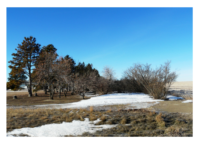
Figure 3. A well-designed and maintained shelterbelt in central Montana's 11" precipitation zone. Row spacing, fallow ground and snow capture help keep trees that need at least 16" annual precipitation to stay alive.

Although valid arguments are made that crop windbreaks take up valuable space which could be cropped,