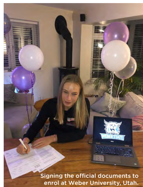
Signing the official documents to enrol at Weber University, Utah.

"I started the process around two years ago and competed loads to achieve the tennis results that I needed. I also connected with the different coaches at the universities, having multiple FaceTimes which resulted in being offered a place by some. I ended up choosing Weber because I really liked the coaches and the university itself has incredible facilities and looks just amazing. I will be training two hours a day on top of my fitness routines and then competing at the weekends in either local tournaments or flying to places such as Las Vegas and Colorado Springs! I feel so proud and happy to be finally fulfilling my dreams with tennis so far. It's been a very long process and I'm so glad it all paid off."