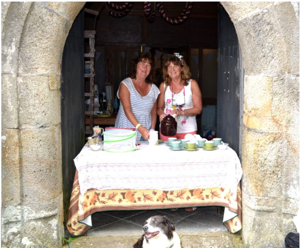
Jeffrey (the dog) photo bombs the fete