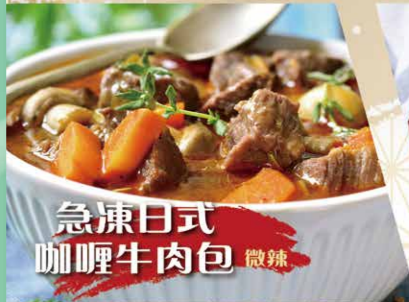
急凍日式 咖喱牛肉包 微辣