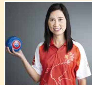
余丹霞 Esther Yu