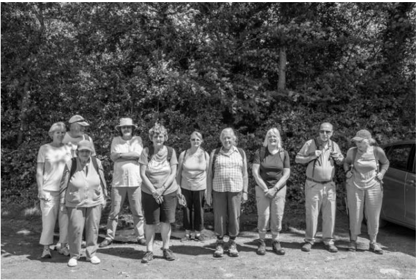
Setting off from Herstmonceux Parish Church.

Passing a small herd of cows, who were sensibly resting in a buttercup-laden field, we walked along by a wide stretch of still water before we began to climb the hill to Wartling. It wasn't long before we spotted the newly shingled spire of the church and arrived at the churchyard ready for a rest and a drink before our return journey.