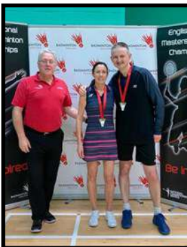
National O50Mixed Winners