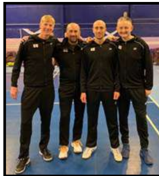
McCoig Trophy England Squad