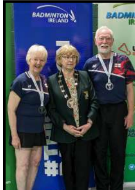
Irish Invitation Silver