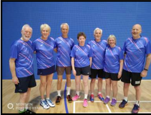
ICC Division 1A Winners