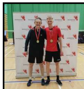
All England Over 50 winners 2023

I hope you all have a great summer and comeback next season ready to go again.