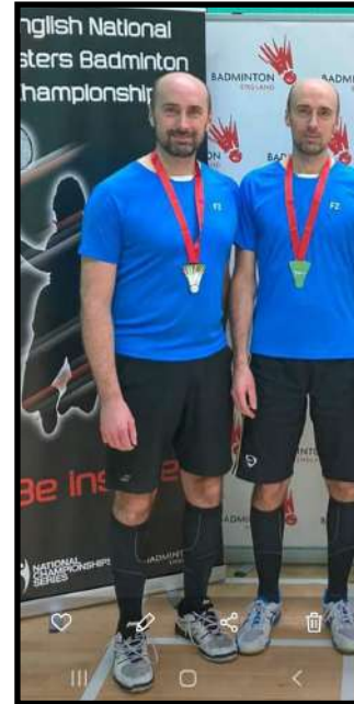
White Brothers Winners