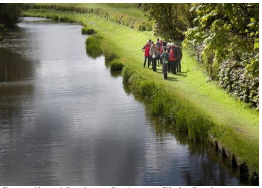
Council and Lytham St Annes Civic Society.