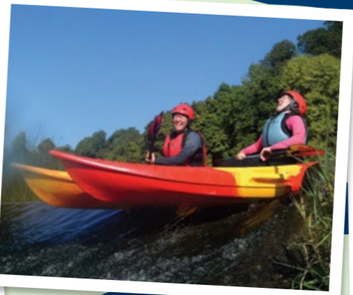
Boyne Valley Activities