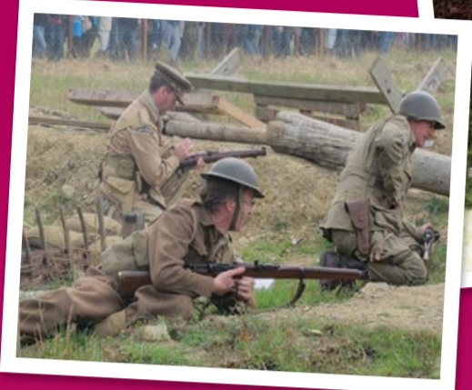
Irish Military War Museum