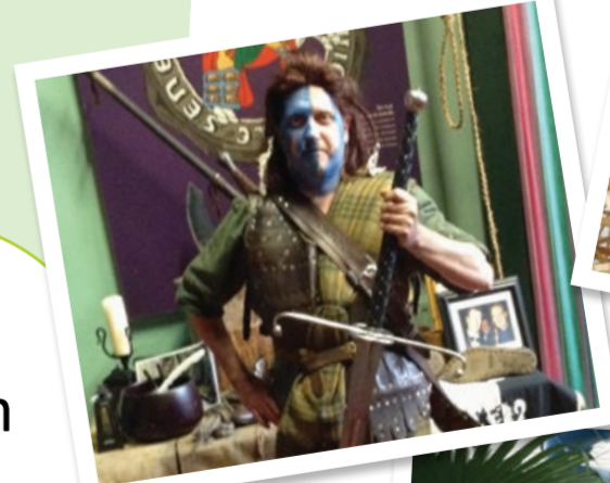
Trim Living History Tours