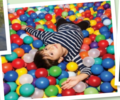
Puddenhill Adventure Centre