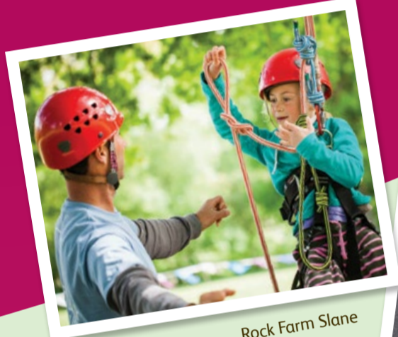
Rock Farm Slane