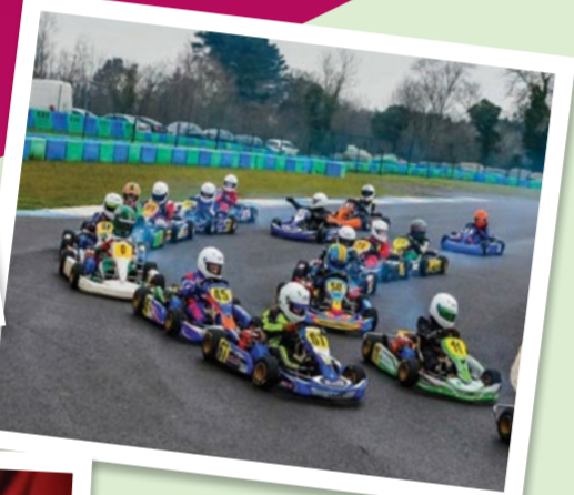
White River Karting