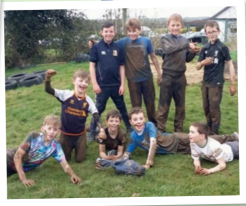
Adventure Sports Navan