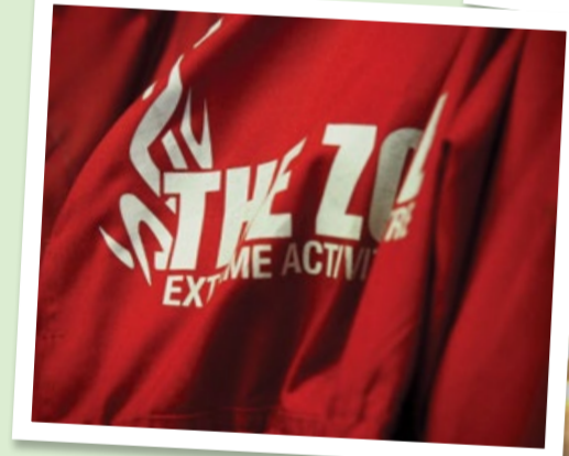
The Zone Extreme Activity Centre