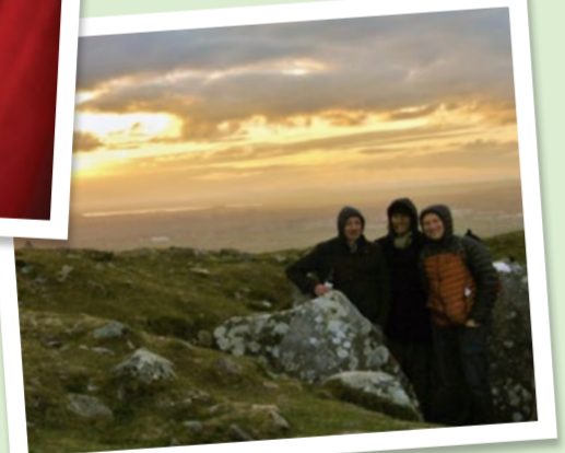
Loughcrew Megalithic Centre