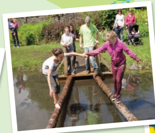
Loughcrew Adventure Centre