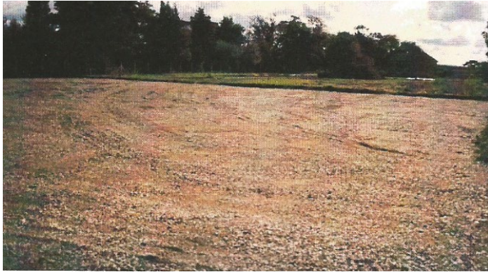
The new Dolphin site before building commenced

The lack of land became very depressing for the Steering Committee, as it looked then that no suitable sites were available. However, the Council Officers finally came up with the suggestion of a site at Fleetsbridge, which was then a field, but had been earmarked for a sports activity. This was quickly accepted, and various covenants had to be resolved before building commenced.