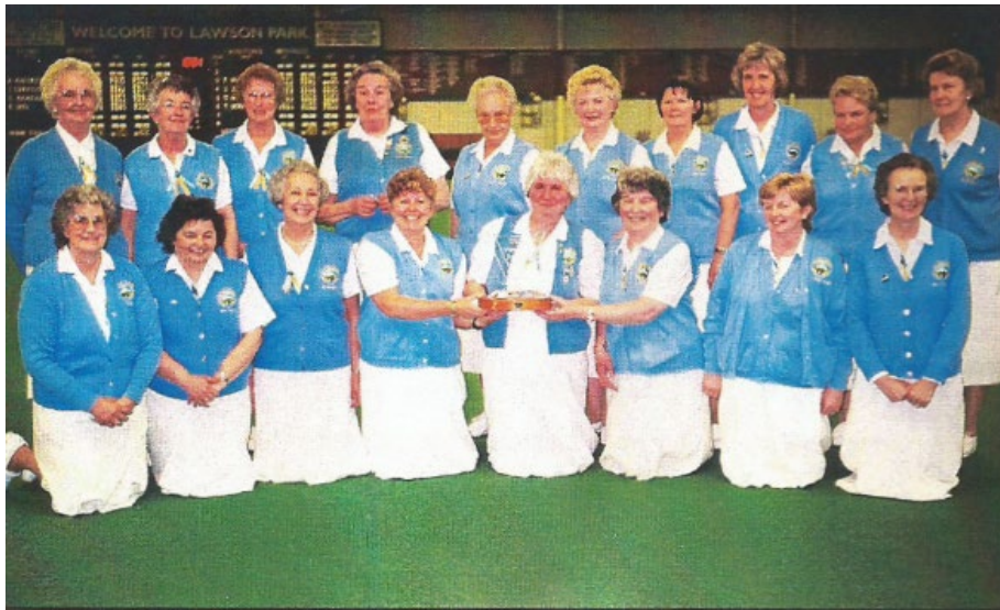
VIVIENNE TROPHY WINNERS 1999 at LAWSON PARK L.B.C. - SATURDAY 20th MARCH 1999