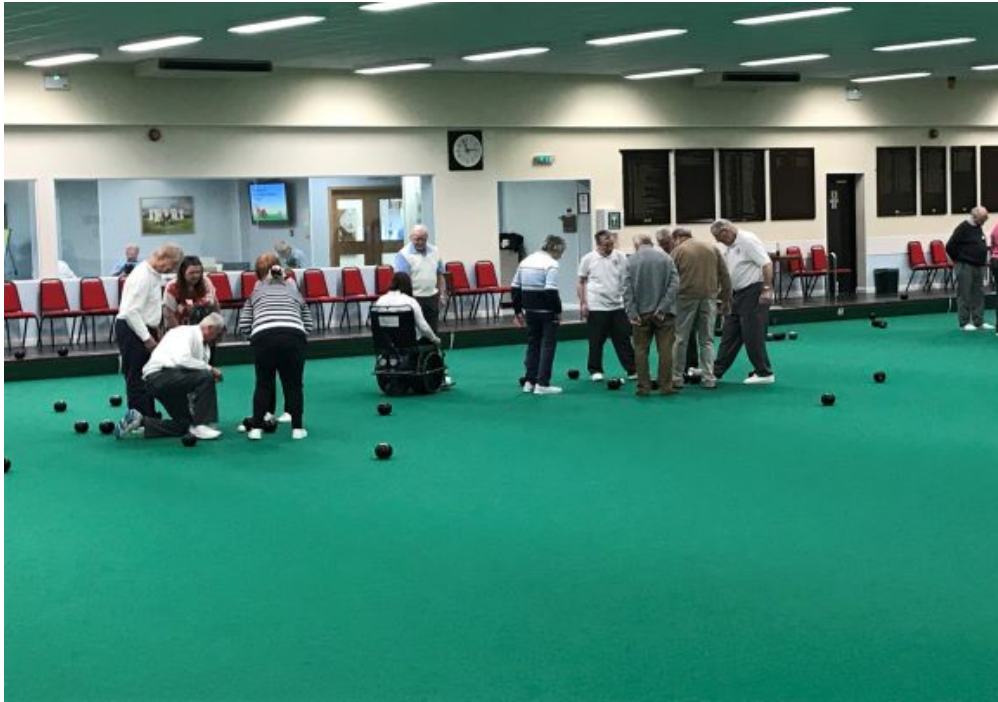
New Members being coached at the Dolphin, February 2020.