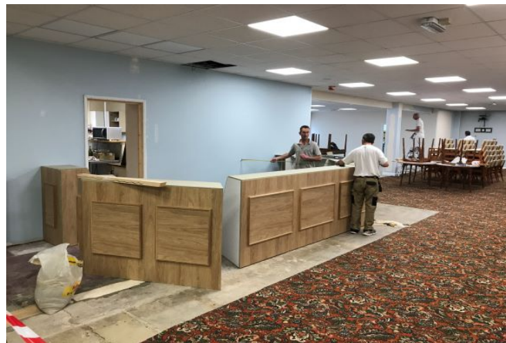
Building the new bar in September 2017

In 2019 the top lounge was completed complementing the lower lounge with its furniture and chairs.