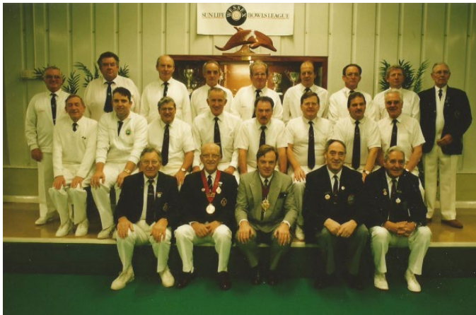
Dolphin Sunlife Wessex Team 1993