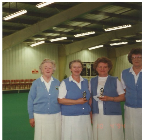
Dolphin Ladies Presentation 1993/1994