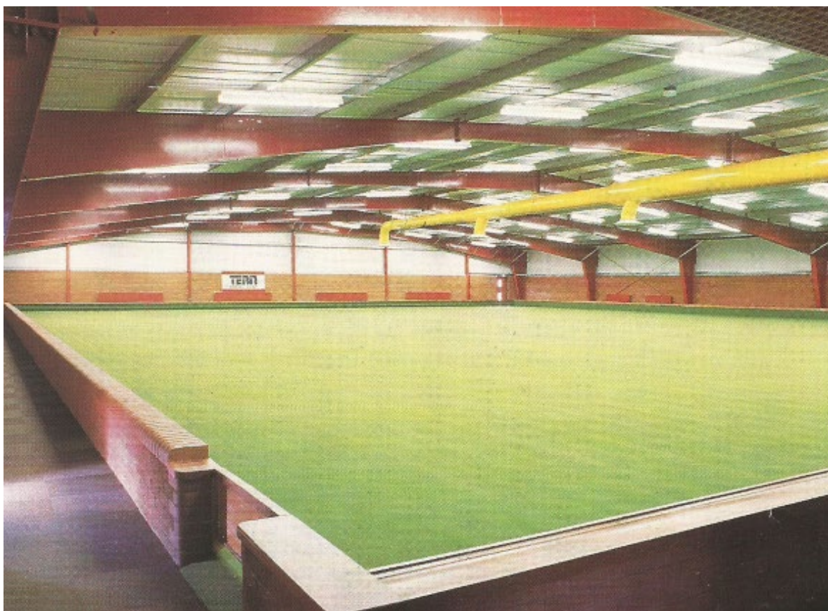
How the Dolphin looked in 1985

The six-rink complex was completed in March 1985 and the Constitution and Limited Company was formed with a Management Committee being responsible for running the Company and with a Men's and Ladies Committee all being elected annually. The Club officially opened on the 30 th March 1985 and the first friendly match was against West Cornwall Indoor Bowls Club, which took place the following day on the 31 st March 1985. Although West Cornwall IBC no longer exists, they continued touring the Bournemouth area and only stopped a couple of years ago.