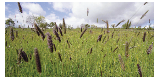
Photo above: Black grass in a barley crop. It grows up to 80cm and at very high densities competing with the crop and seriously reducing the yield.

So far the results of this environmentally friendly weed control technique have been encouraging, especially with spring barley. Wykeham Farms is also exploring leaving land fallow for a year or using cover crops such as clover, oats and radishes to improve soil structure during the fallow year.